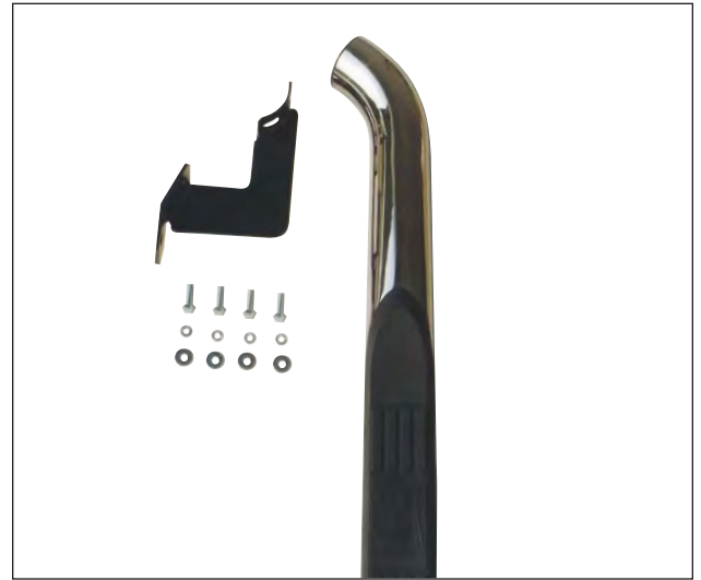
PASSENGER FRONT -