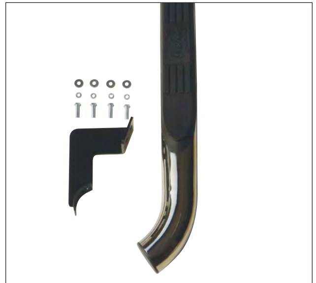
PASSENGER REAR -