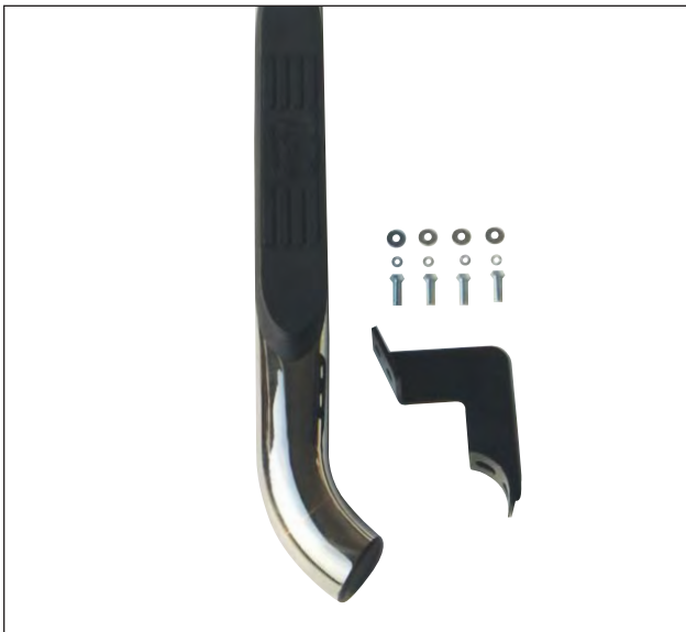
DRIVER REAR -