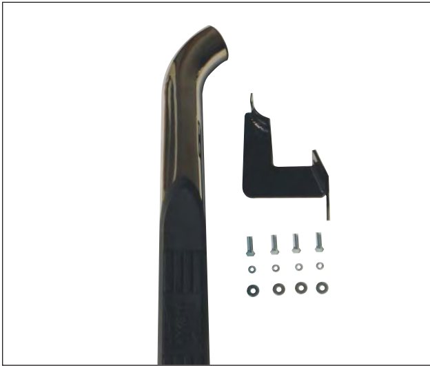
DRIVER FRONT -