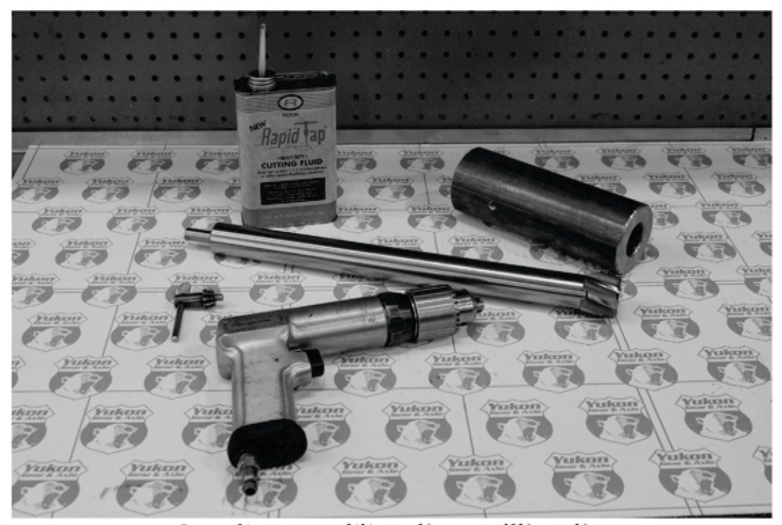
In order to use this tool, you will need: