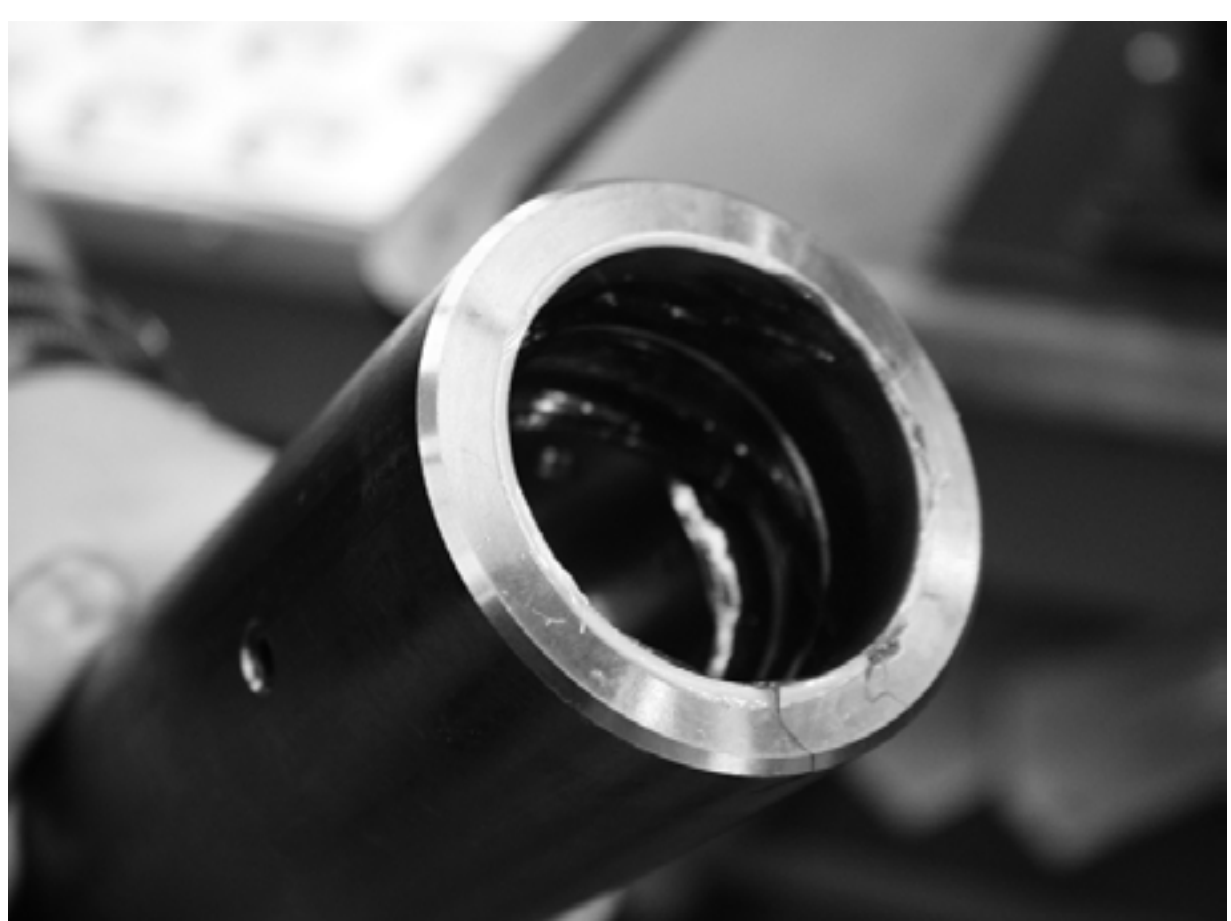
Apply a liberal amount of bearing grease to the boring tool threads.