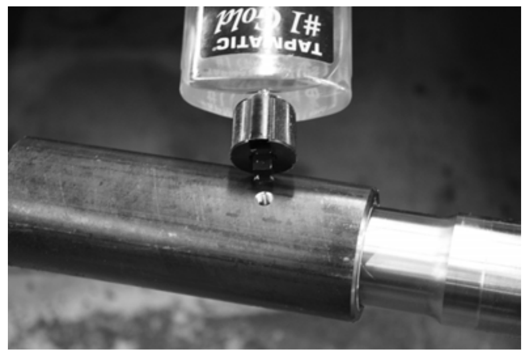
Apply a liberal amount of cutting fluid through the oiling port on the boring tool housing. You will need to add more fluid as you go. It is <u>VERY IMPORTANT</u> to add cutting fluid as necessary to make sure the cutting head has proper lubrication. FAILURE TO DO THIS WILL RESULT IN PERMANENT DAMAGE TO BOTH THE BORING TOOL AND YOUR HOUSING.