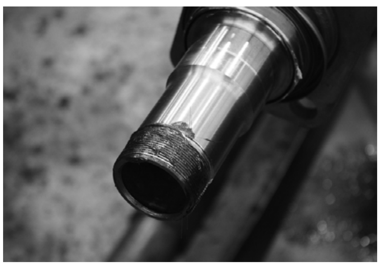
Apply a liberal amount of bearing grease to the spindle threads.