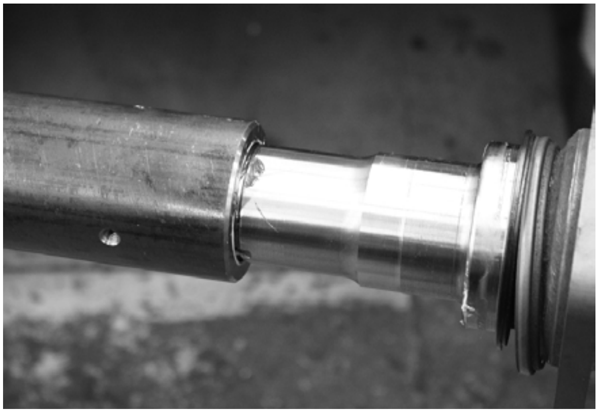
<u>CAREFULLY</u> thread the boring tool onto the spindle. Be sure that you have enough grease on both the boring tool and the housing. Thread the tool on <u>slowly</u> as to not damage the threads.