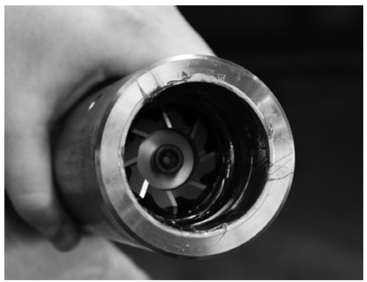
Slide the cutting head/boring shaft into the boring tool housing.