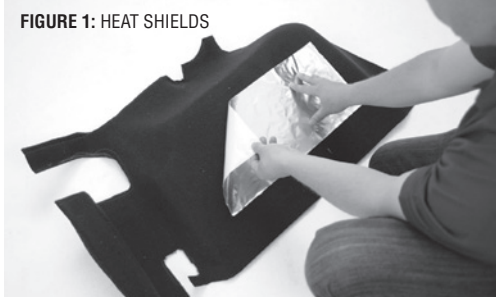
FIGURE 1: HEAT SHIELDS