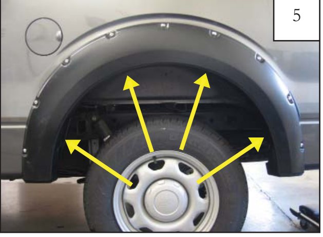
Hold flare to vehicle and mark the location with a grease pencil of the four holes in the flare.