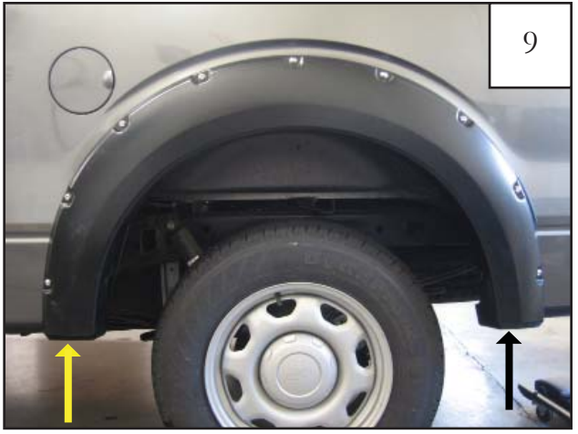
Using a 10 mm socket wrench, reinstall factory bolts.