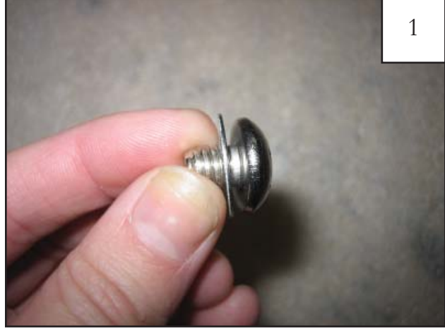
Put a Washer (WA1-0012) on each Bolt (SW1-0067).