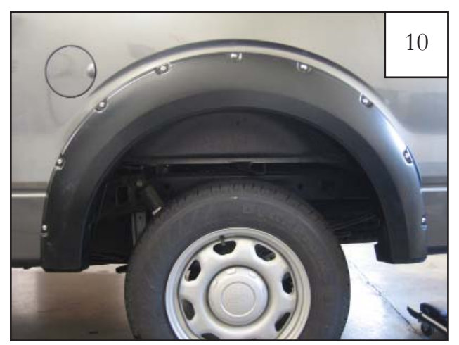
Completed rear flare installation.