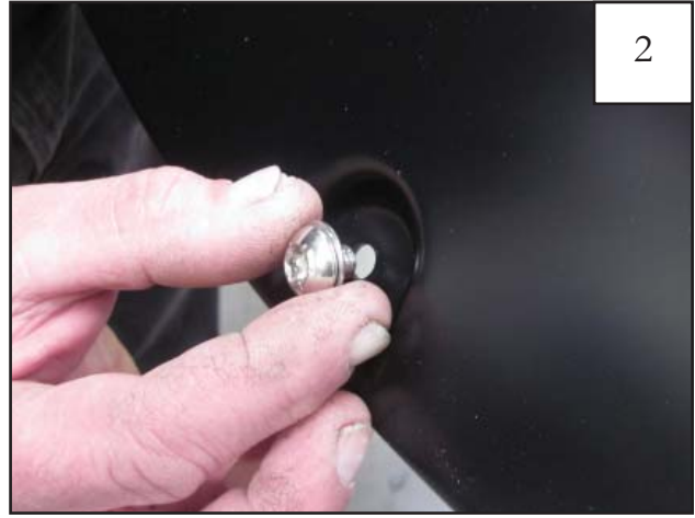
Put each Bolt/Washer combination through a pocket hole in the flare, Bolt head and Washer on the outside.