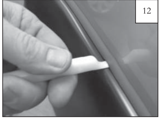
Using flat end of supplied Edge Trim Tool (ET1-0002), seat edge trim against flare by inserting straight end between edge trim and flare at one end. Next, slide around entire edge to the other end.