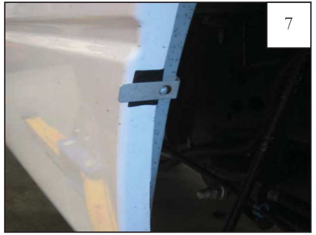
Install a Clip (CL1-0009) over each of the four Tabs (MT1-0014) placed on the sheet metal in Step 6.