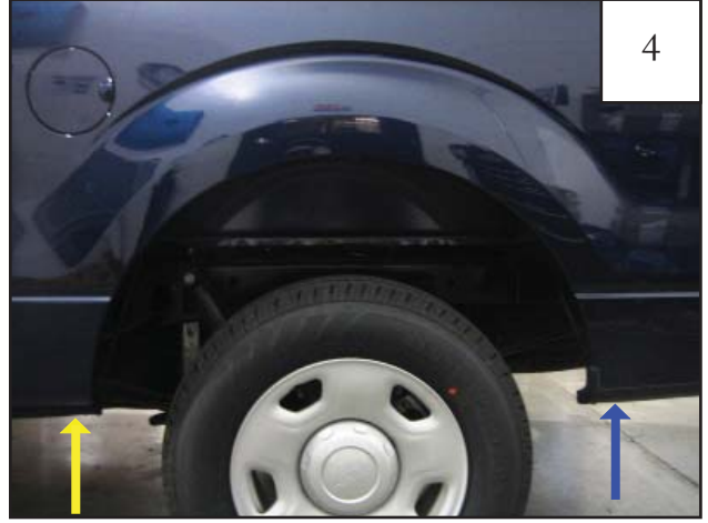
Remove two factory bolts with a 10mm socket wrench. Save for reinstallation.