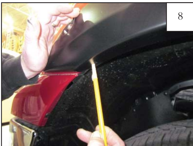
Hold front of the flare firmly on the fender. Mark three Clip (CL1-0005) locations using the holes in the flare as a guide.