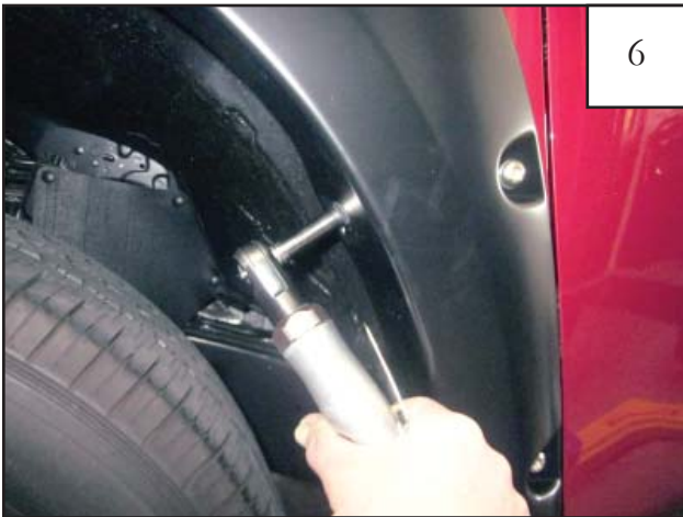
Start supplied Screw (SW1-0036) through top rear hole in flare and into factory hole in rear of wheel well. Do not tighten.