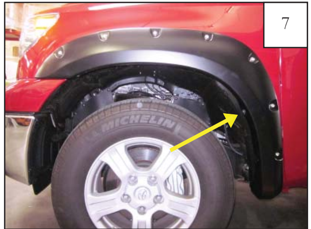
Screw (SW1-0036) location.