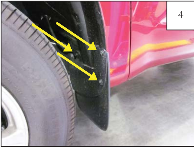
Remove three hex bolts from factory mud flap, using a 10mm socket.