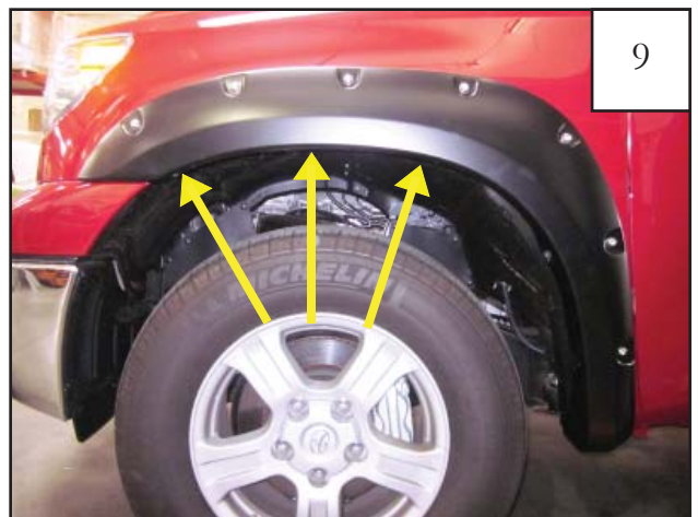
Three marked Clip (CL1-0005) locations.