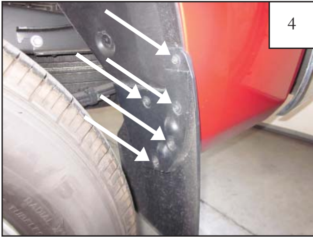
Remove five hex bolts from factory mud flap using a 10mm socket.