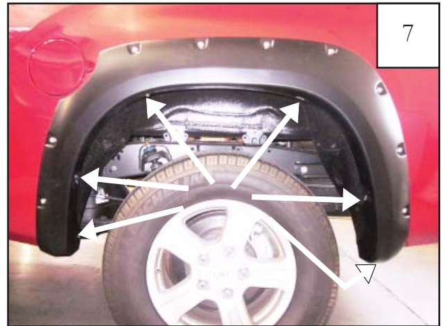
Hold flare firmly on the fender. Start a supplied Screw (SW1-0036) through each hole in flare and into hole in fender. (6 locations)