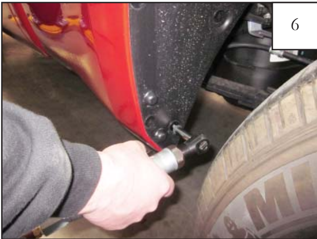
Using a socket wrench with a 10mm socket, remove lower screw from front of rear wheel well as shown.