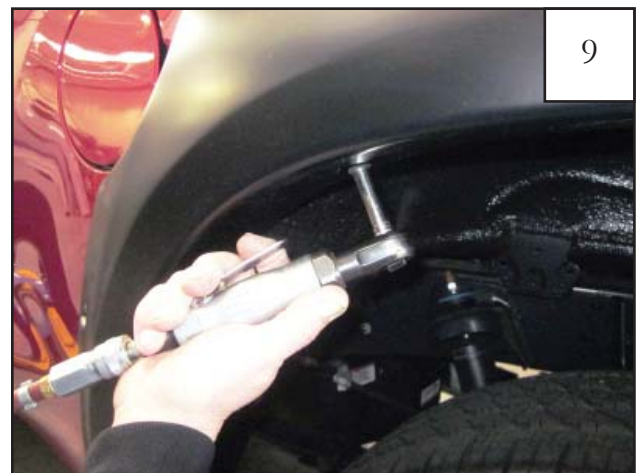
Ensure flare is properly positioned and tighten all screws.