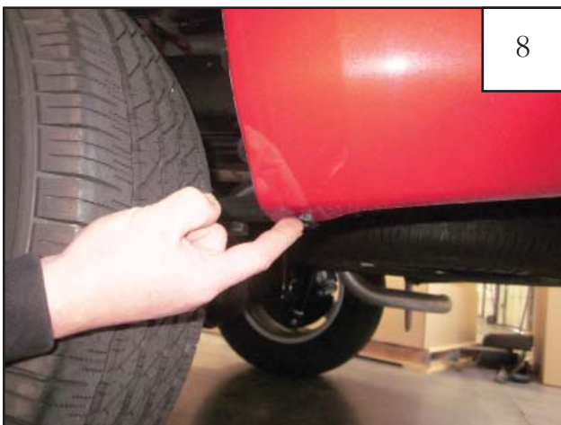
NOTE: If the lower rear wheel well does not contain a plastic grommet, insert supplied Grommet (GR1-0001) into the factory hole as shown.