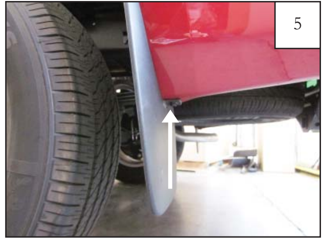
Remove one hex bolt from underside of mud flap using a 10mm socket. Discard mud flap.