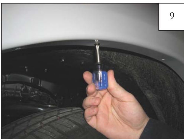
Align holes in flare with holes in clips. Start three supplied Serrated-Flange Screws through three holes in flare and into "S" Clips installed in Step 7. Note: It is helpful to use an awl to locate holes in clips.