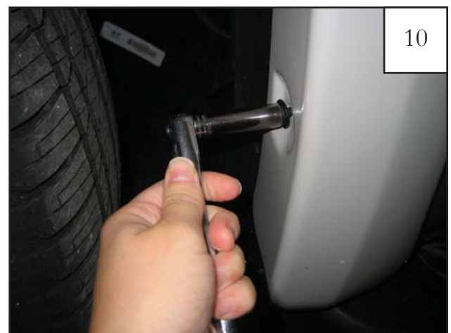
Make sure flare is positioned correctly on vehicle. Tighten all screws.