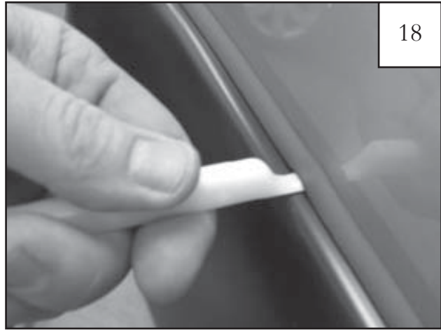
Using flat end of supplied Edge Trim Tool (ET1-0002), seat edge trim against flare by inserting straight end between edge trim and flare at one end. Next, slide around entire edge to the other end.