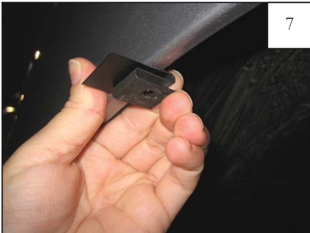
Slide a supplied "S" Clip over each Tab.