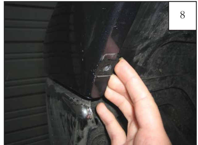
Slide a supplied "U" Clip over the fender lip, aligning with forward-most hole in fender. Note: For the Limited version, skip this step.