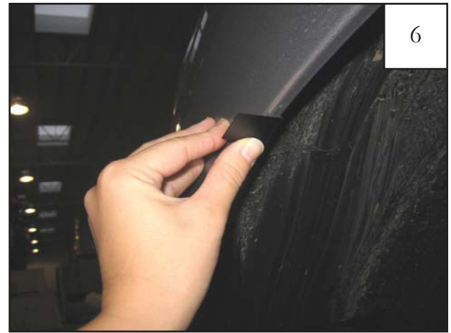
Remove flare from fender. Center a supplied Black Tab over each mark made in Step 4.