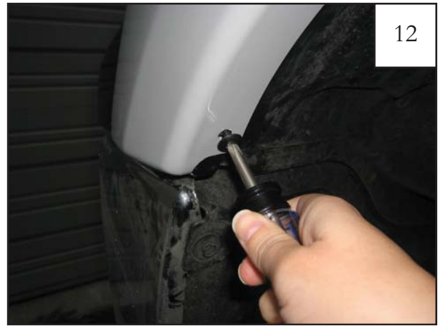
Hex Screw locations.