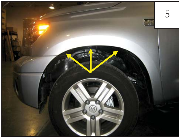
"S" Clip locations.