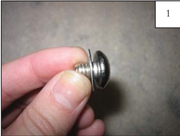
Put a Washer (WA1-0010) on each Bolt (SW1-0059).