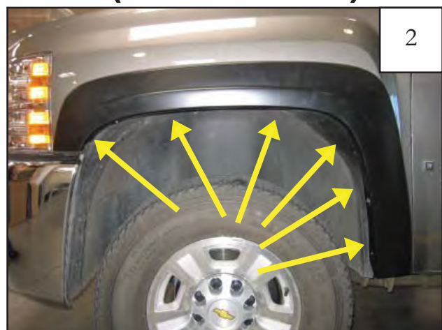
Install six tuflocks using a #2 stubby screwdriver.