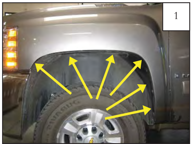
Remove six factory fasteners with a pry tool.