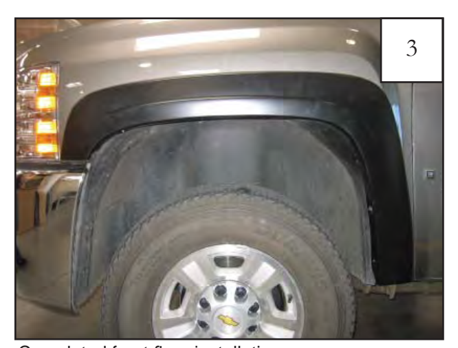
Completed front flare installation.