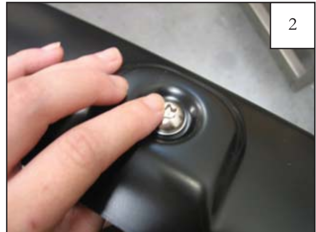
Put each Bolt through a pocket hole in the flare, bolt head on the outside.