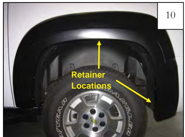
Retainer (RV1-P006) locations.