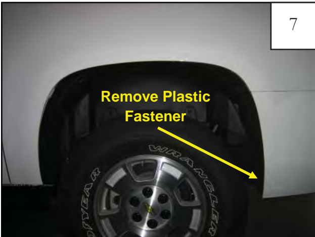
Using a flat head screw driver, remove one factory plastic retainer and discard.