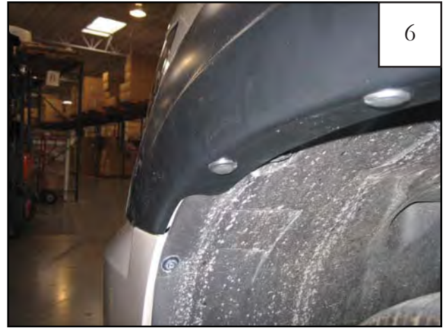
Install a supplied Retainer (RV1-P006) through hole drill in Step 5.