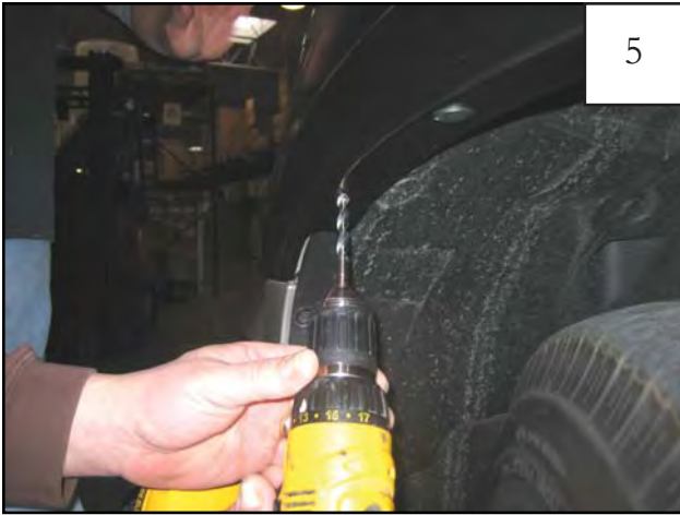
Using hole located in forward portion of flare as a guide, drill through the splash shield with a 5/16" bit. Holes in flare and splash shield should align with factory hole located in fender.