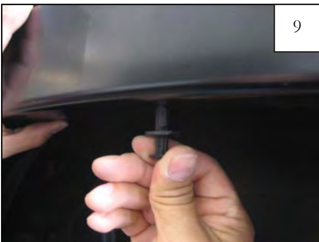
Holding flare in position on fender, install two Retainers (RV1-P006) as show in Step 10.