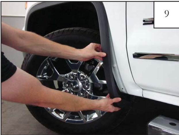
Starting at the lower rear end of the factory flare, firmly grip part and pull to remove from vehicle. Note: You will hear popping sounds as the factory fasteners release from vehicle. This is normal.