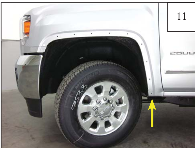
Reinstall factory fastener removed in step 6 using a 1/2" socket and wrench.