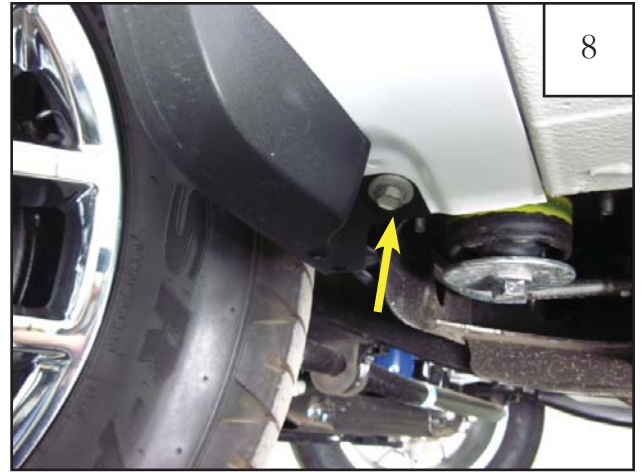
Remove fastener from rear underside of factory wheel arch molding using a 1/2" socket and wrench. Save for reinstallation.