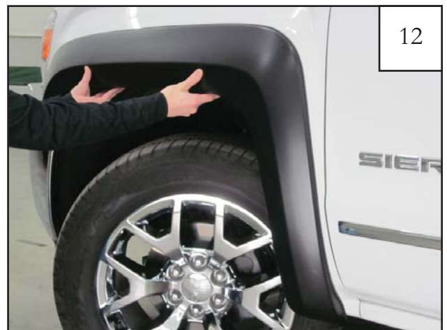
Hold Front Flare up to wheel well to confirm fit. Do not install fasteners at this time.