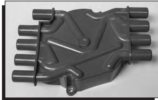
Figure 2 Distributor Cap.