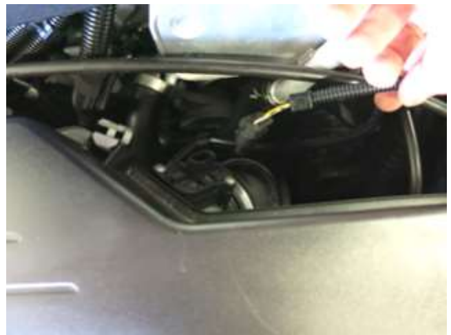
b. Disconnect the Mass Air Flow (MAF) sensor harness by depressing the little tab on the connector and pulling.