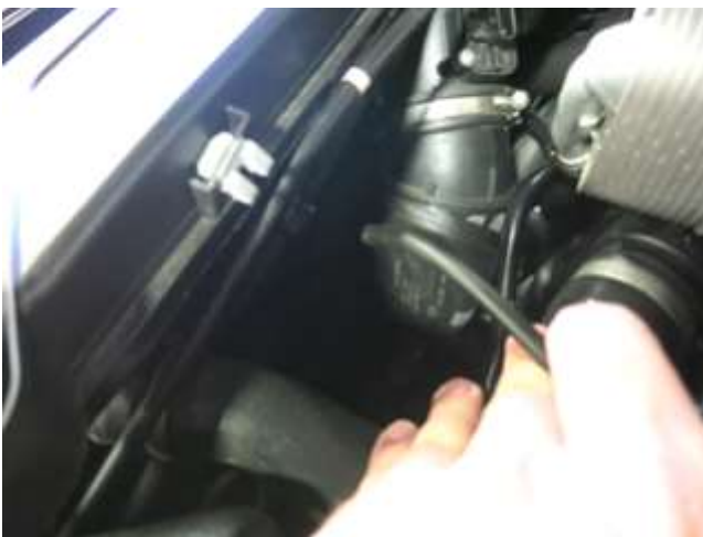
c. Pull the vacuum line off of the nipple on the back of the stock air box. (Skip this step for vehicles not equipped with this vacuum line.)