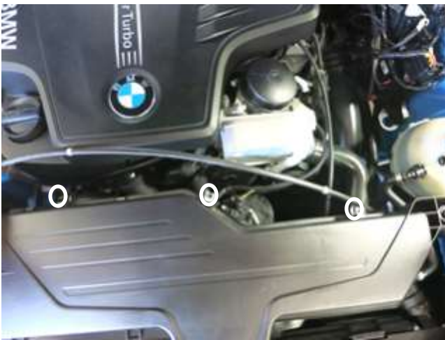
a. Pull the hood release cable from the [3] clips on the stock air box.