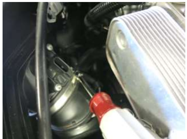
d. Use a 6mm nut driver to loosen the hose clamp near the MAF sensor.