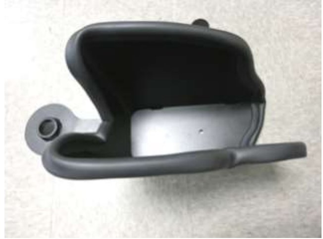
b. Install the supplied rubber edge trim onto the AEM heat shield assembly as shown.