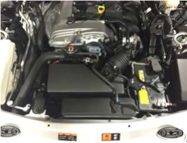
STOCK INTAKE INSTALLED