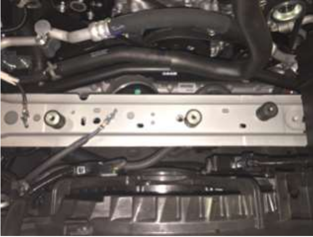
a. Install the supplied rubber isolator mounts into the engine compartment as shown.