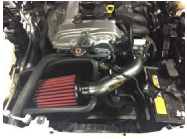
AEM INTAKE INSTALLED