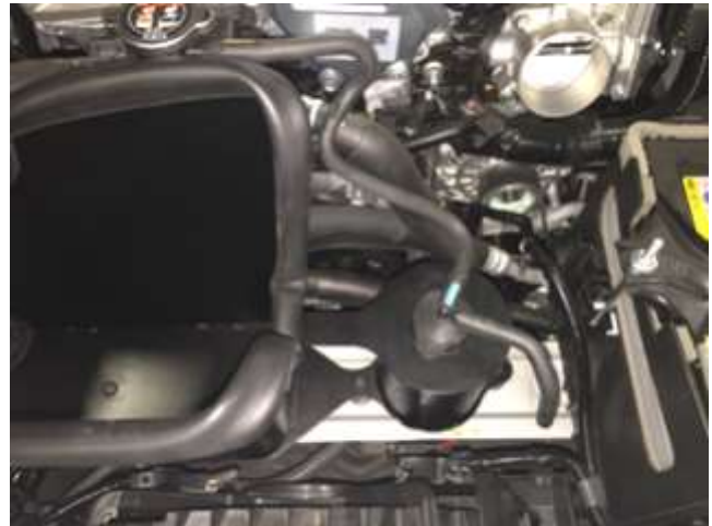
d. Transfer the coolant from the factory tank into the AEM reservoir and seal with factory cap. The capacity of the AEM reservoir is different from the factory reservoir but it does not affect the functionality.