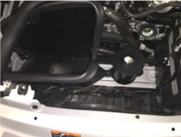
c. Install the complete heat shield assembly into the engine compartment as shown and secure with supplied hardware.