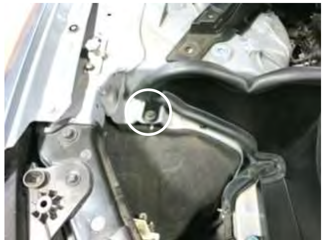
f. Using a bolt from step 2h, secure the heat shield to the vehicle.