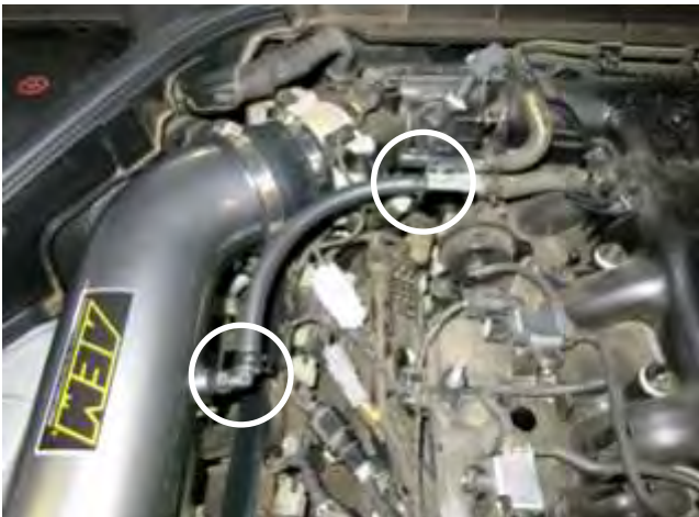
k. Slide the spring clamps that were removed in step 2l. onto the provided hose. Then, attach the hose to the AEM intake tube and 2-way check valve. Note: Trimming the hose may be necessary.