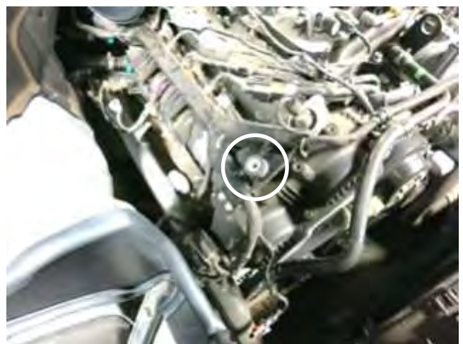
h. Install the provided rubber mount onto the passenger valve cover where the original bolt was removed in step 2k.