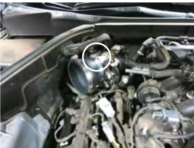
g. Install the provided coupler onto the throttle body, tightening the hose clamp closest to the throttle body to 30 in-lbs.