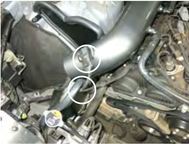
m. Clip the pressure sensor connector into the pressure sensor. Then, clip the harness to the AEM heat shield.