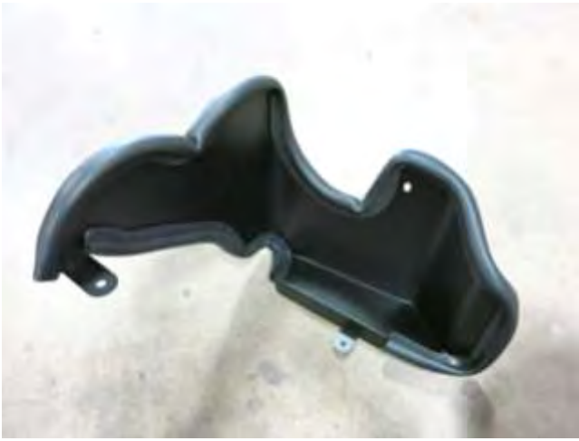
c. Install the provided edge trim around the AEM heat shield as shown. Note: Cutting the trim to fit will be necessary.