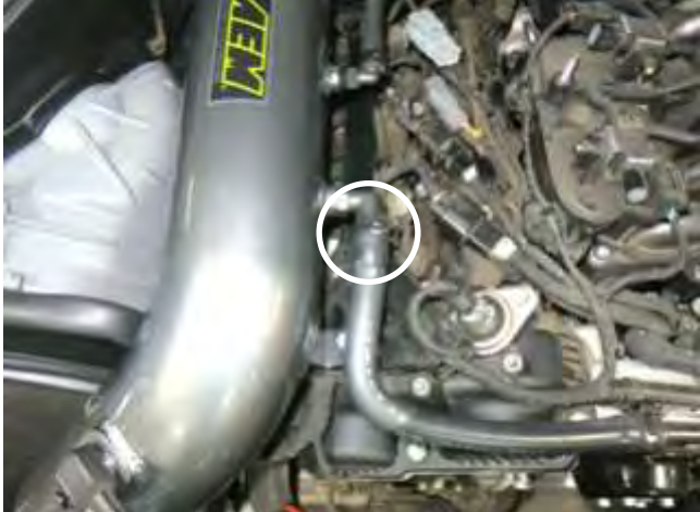
l. Install the vent line and clamp from step 2f onto the AEM intake tube.