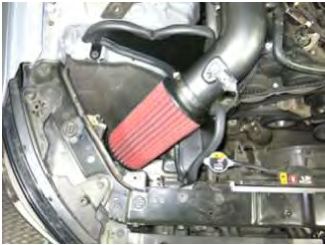
n. Install the AEM filter into the vehicle and onto the AEM intake tube. Tighten the provided hose clamp to 30 in-lbs.