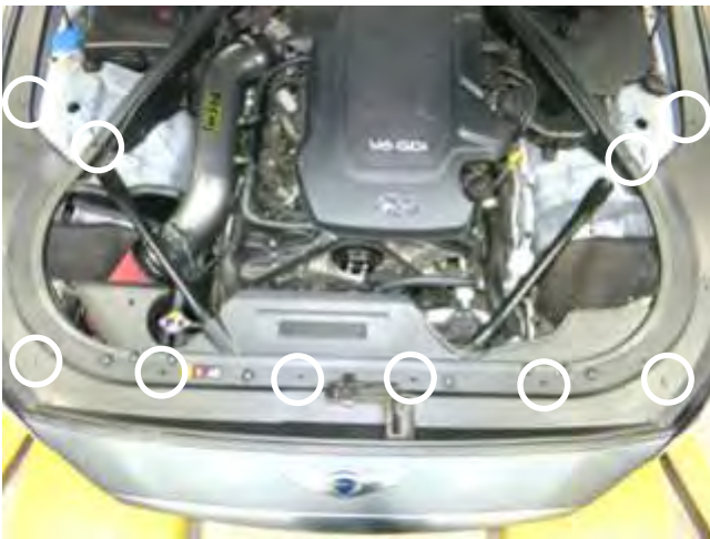
q. Reinstall the engine bay cover into the vehicle and secure with the clips removed in step 2a. Note: You will only use 12 of the clips (not all pictured)