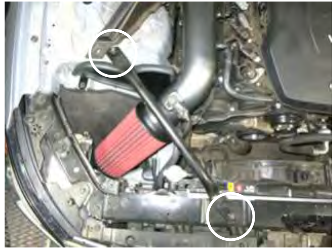
p. Reinstall the brace and bolts onto the vehicle and tighten to 3.6 ft-lbs.