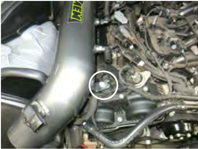
j. Install the bolt removed in step 2k. to secure the AEM intake tube to the rubber mount.