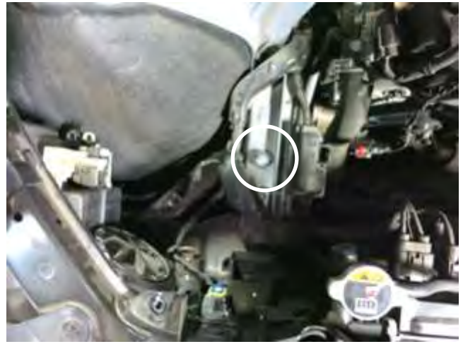
d. Install the provide rubber mount into the vehicle chassis as shown.