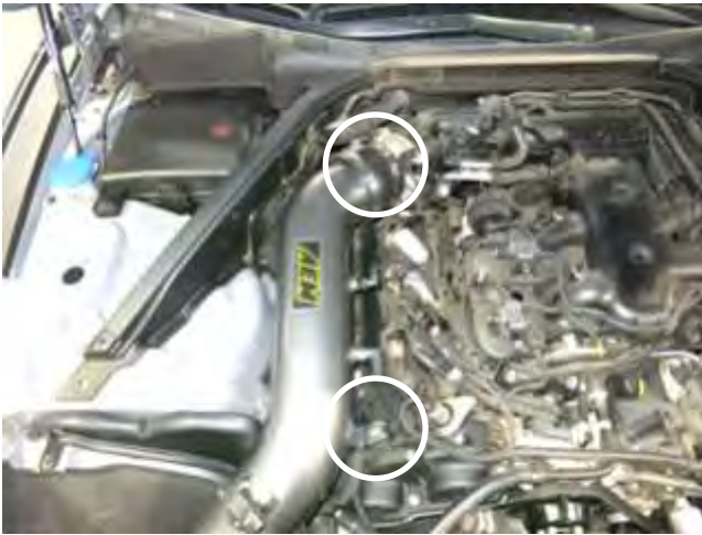
i. Install the AEM intake tube into the coupler while aligning the bracket with the rubber mount. Then tighten the hose clamp at the AEM intake tube.