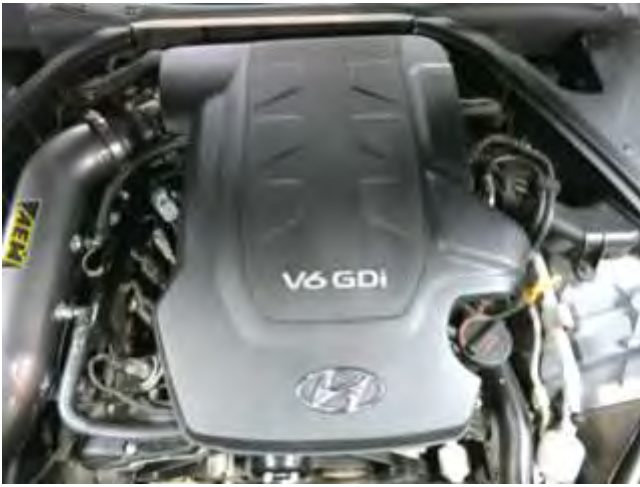
o. Reinstall the engine cover that was removed in step 2b. by aligning the 4 mounts to its grommets.