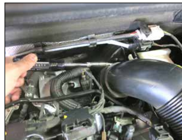
3. Loosen the hose clamp at the turbocharger and disengage the intake hose from the turbo inlet.