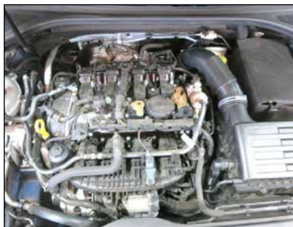
2. Remove the plastic engine cover by pulling up gently, releasing it from the rubber grommets.

NOTE: Disconnecting the negative battery cable erases pre-programmed electronic memories. Write down all memory settings before disconnecting the negative battery cable. Some radios will require an anti-theft code to be entered after the battery is reconnected. The anti-theft code is typically supplied with your owner's manual. In the event your vehicles anti-theft code cannot be recovered, contact an authorized dealership to obtain your vehicles anti-theft code.