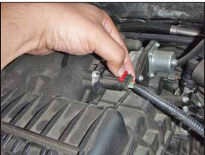
c. Release the locking mechanism on the connector.