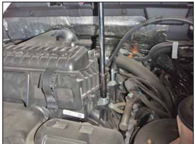
j. Remove the two bolts located on the driver side of the air box.