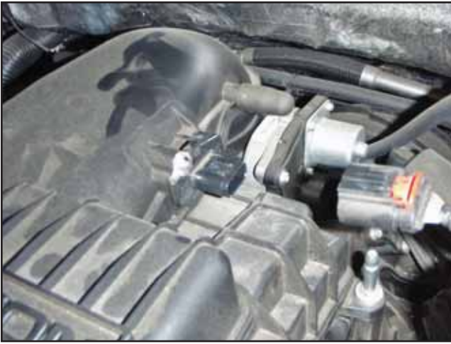
e. Connector disengaged from the sensor.