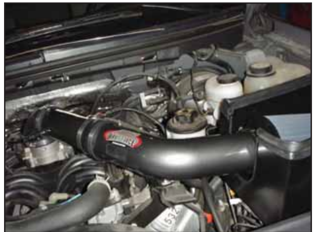
AEM® intake system installed