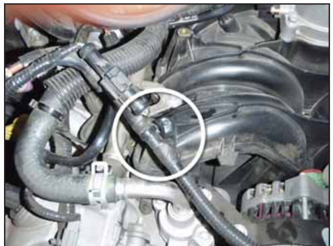
e. Secure the wiring harness that was unclipped in step 2i. with the tree mount zip tie.