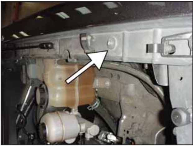
q. Remove the bolt located on the driver side fender shown in the picture.