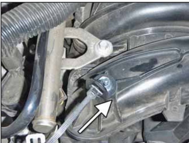
d. Insert the tree mount zip tie into the hole in the bracket installed in step 3c.