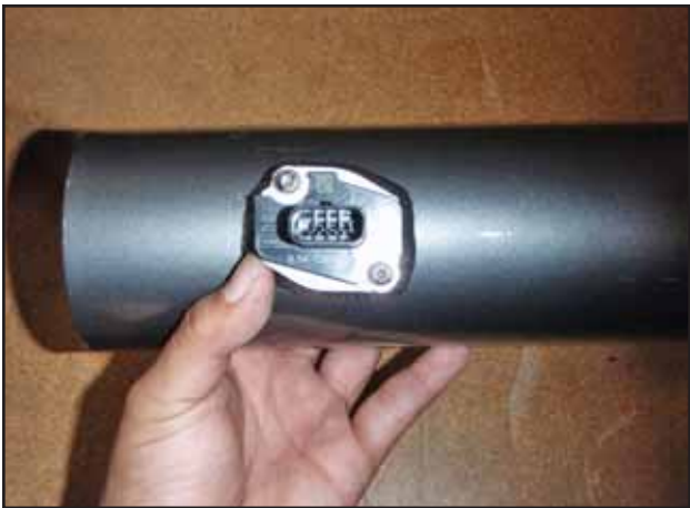
b. Install the mass air flow sensor into the straight upper inlet pipe. Use the two factory socket bolts to secure the sensor.

a. When installing the intake system, do not completely tighten the hose clamps or mounting hardware until instructed to do so.