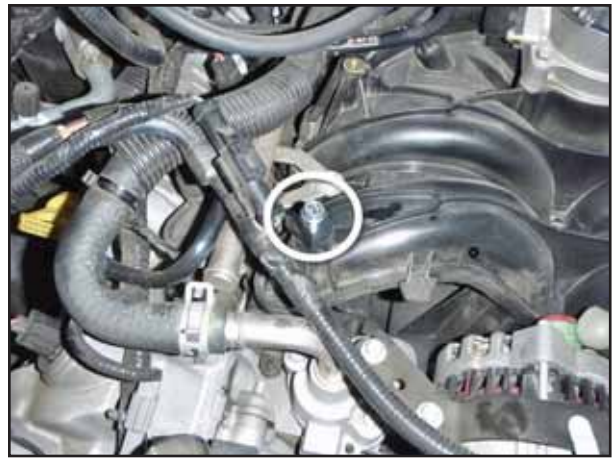
c. Install the small bracket (7-7717) secure it to the intake manifold threaded insert using the supplied m6 hex flange bolt.