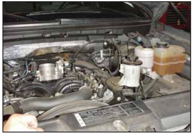
r. Stock air box system removed from the vehicle.