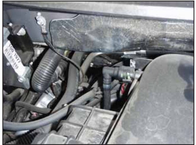
f. The PCV hose is located on the opposite side of the air box from the mass airflow sensor.