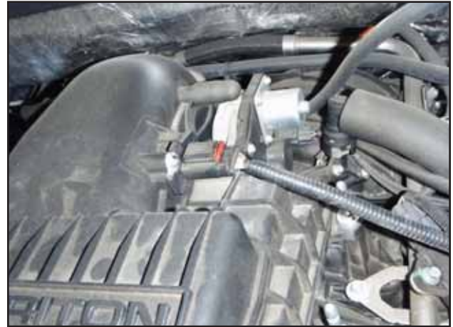
b. Locate the mass airflow sensor and the connector on the air box.