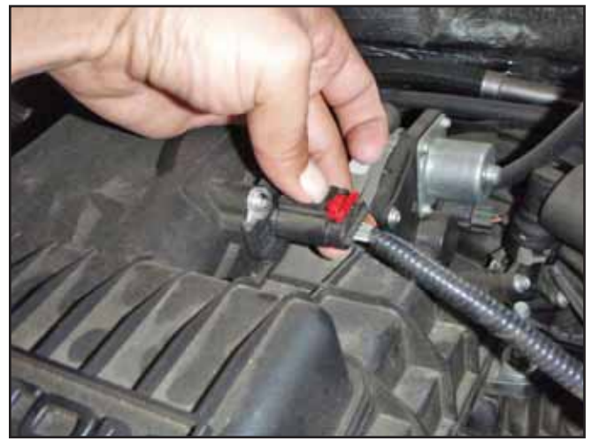
d. Press the plastic clip on the connector down and pull the connector away from the sensor.