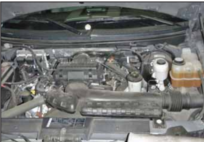
Factory air box system installed

x. Reconnect the mass airflow sensor harness that was disconnected in 2d. to the mass airflow sensor and lock it.