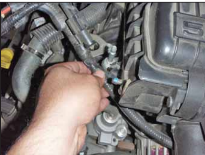
i. Unclip the wire harness attached to the air box located on the lower left hand side of the air box.