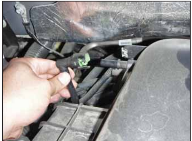
h. Pull the PCV hose away from the air box.