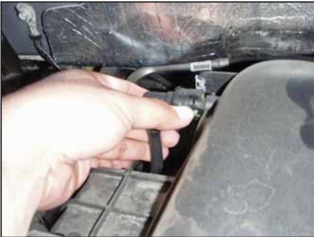
g. Release the green locking mechanism on the PCV hose connector.