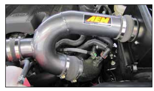
17. Install the AEM® intake tube into the couplers at the turbo inlet tubes and then into the coupler at the filter adapter, adjust the tubes for best fit and then secure with the provided hose clamps.