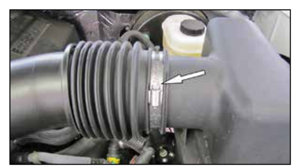
3. Loosen the hose clamp that secures the factory intake tube to the upper air filter housing.