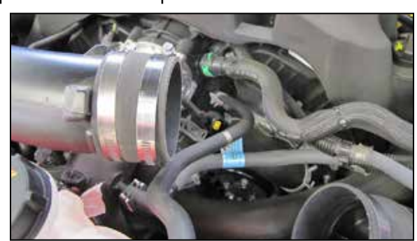
14. Install the provided coupler hose (5-302) onto the passenger side turbo inlet hose and secure with the provided hose clamp.