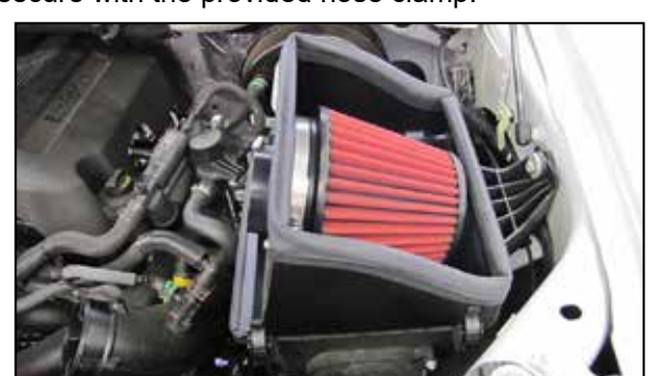
11. Install the heat shield/filter assembly onto the factory lower air filter housing and secure with the factory retaining clips.