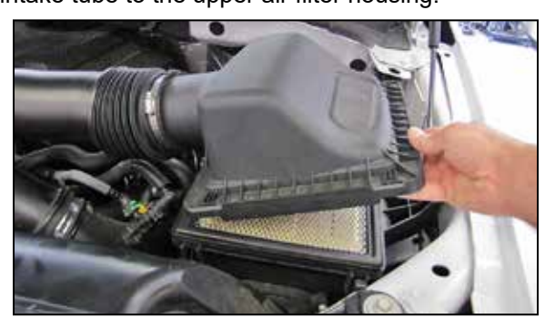
4. Release the locking clips that secure the upper air filter housing to the lower housing, then lift the upper housing and remove it from the vehicle. Remove the factory air filter from the vehicle. NOTE: AEM recommends that customers do not discard factory air intake.