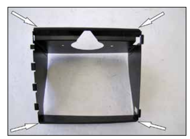
7. Install the small edge trim onto the bottom of the heat shield as shown using the provided super glue to secure it in place.