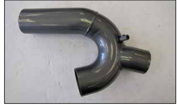
16. Install the provided grommet and inlet air temperature sensor into the AEM® intake tube as show.