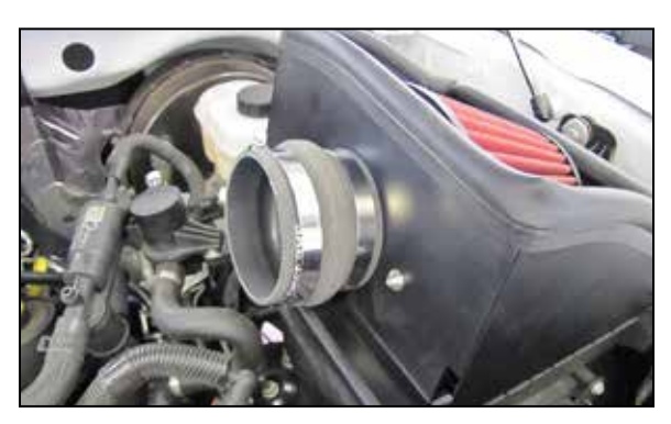
12. Install the provided hump coupler (08699) onto the filter adapter and secure with the provided hose clamp.