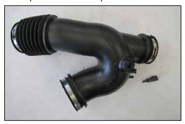
15. Remove the inlet temperature sensor from the factory intake tube.