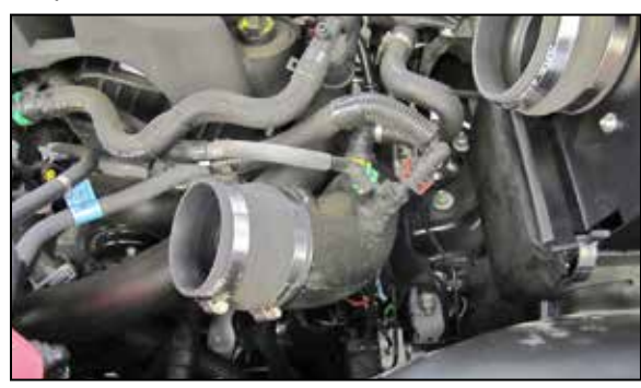
13. Install the provided coupler (08497) onto the driver's side turbo inlet tube and secure with the provided hose clamp.