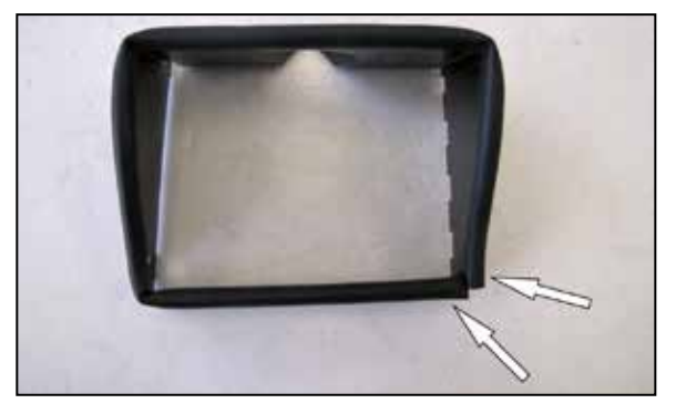
8. Install the provided bulb edge trim onto the top of the heat shield as shown.