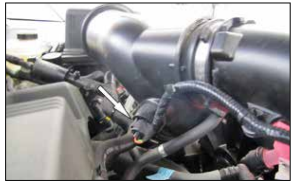
2. Disconnect the inlet air temperature sensor electrical connect and remove the tape around the harness connector.

NOTE: Disconnecting the negative battery cable erases pre-programmed electronic memories. Write down all memory settings before disconnecting the negative battery cable. Some radios will require an anti-theft code to be entered after the battery is reconnected. The anti-theft code is typically supplied with your owner's manual. In the event your vehicles anti-theft code cannot be recovered, contact an authorized dealership to obtain your vehicles anti-theft code.