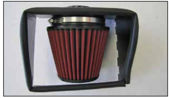
10. Install the air filter onto the filter adapter and secure with the provided hose clamp.