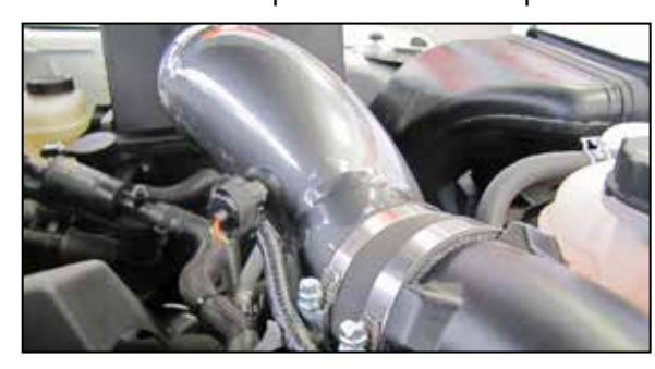
18. Reconnect the inlet air temperature sensor electrical connection.