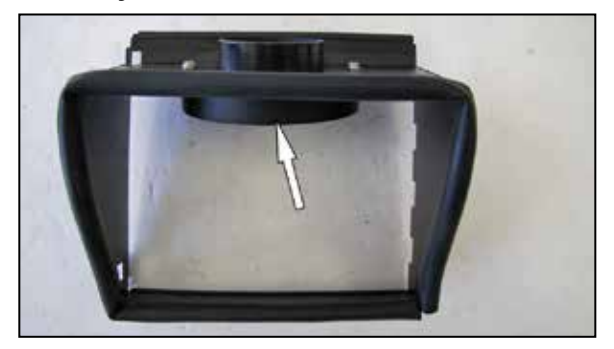
9. Install the filter adapter into the heat shield and secure with the provided hardware.