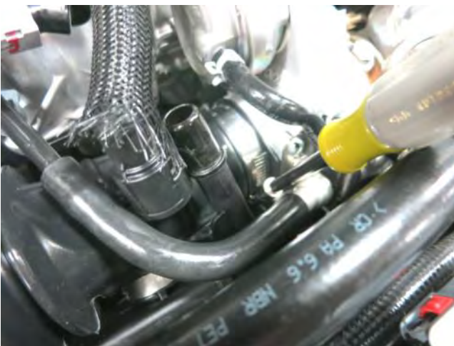
c. Loosen the hose clamp at the turbo side of the factory air hose.