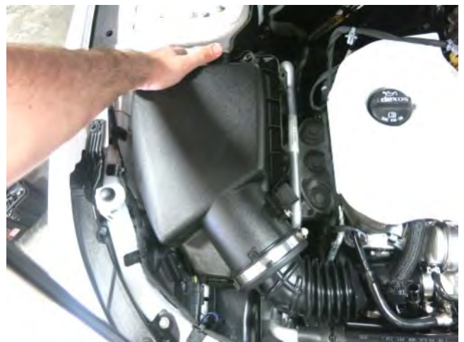
d. Release the air box from its rubber grommets by pulling up gently on the air box as shown.