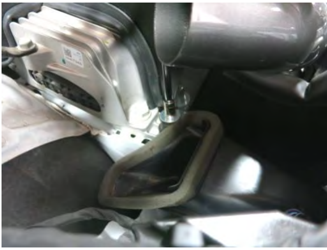
h. Fully tighten the intake tube bracket to the rubber mount at this time.