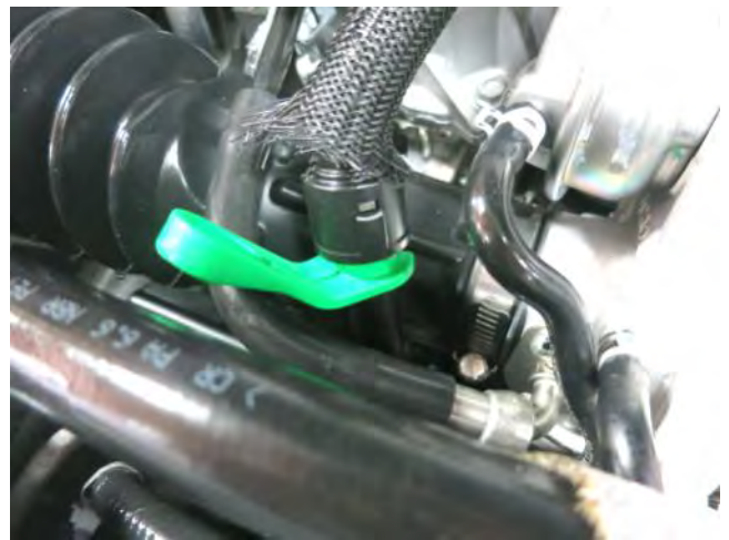
b. Use a 5/8" AC/fuel line disconnect tool to release the PCV connection. Pull the PCV line free and away from the fitting.