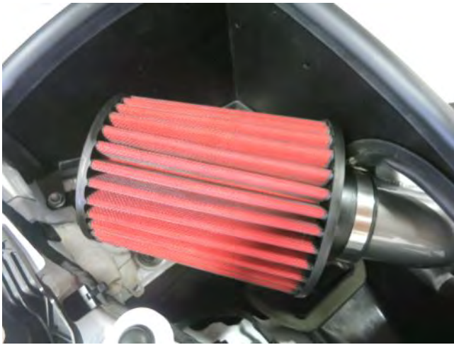
j. Install the AEM Dryflow filter using the provided hose clamp. Tighten the clamp to 30 in-lb.