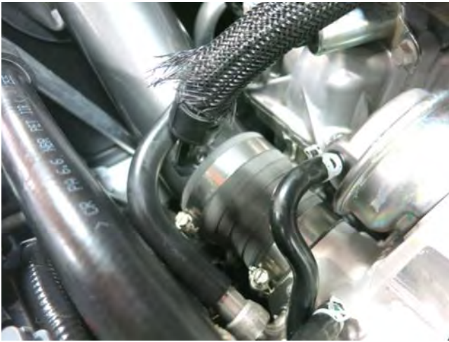
k. Connect the PCV line to the fitting on the intake tube. Ensure it clicks into place and is securely attached.