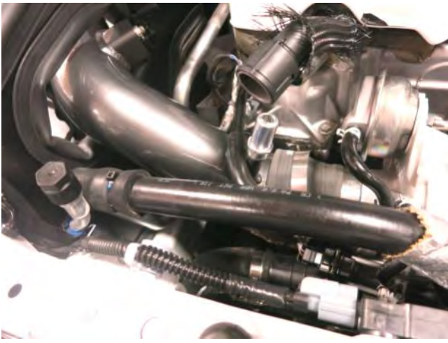
g. Maneuver the fitting on the intake tube past the vacuum line as show. Ensure the intake tube is fully seated into the big end of the coupler. Soapy water can help with installation.