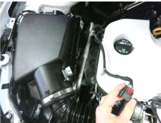
a. Disconnect the Mass Air Flow (MAF) sensor connector and harness ties from the sensor and air box.