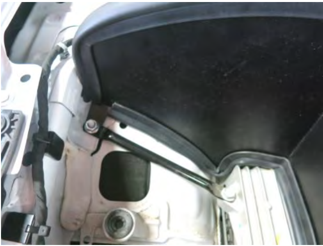
i. Using the nut removed in step 2f, secure the heatshield to the inner fender.