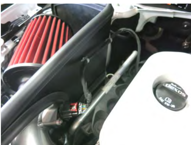
l. Connect the MAF connector to the MAF sensor and secure the harness with the factory ties into the holes on the heatshield. The ties may need to be repositioned for best fit.