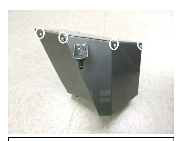
h. Install [4] bolts show above.