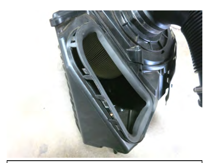
g. Carefully pull the inlet scoop gasket from the air box. You will reuse this later in step 3f.