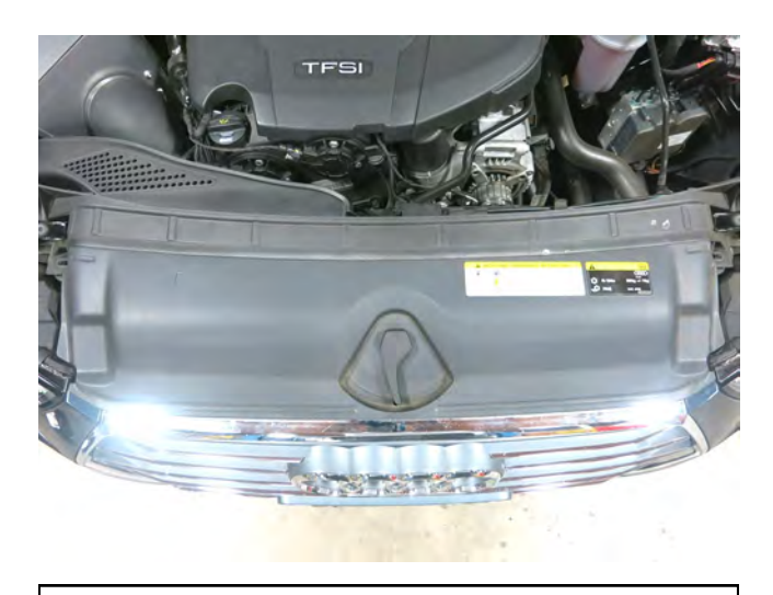
o. Finally, reinstall the radiator shroud and hood release latch.