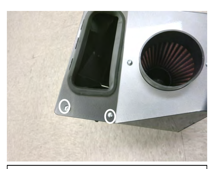
j. Install the remaining [2] bolts shown above.