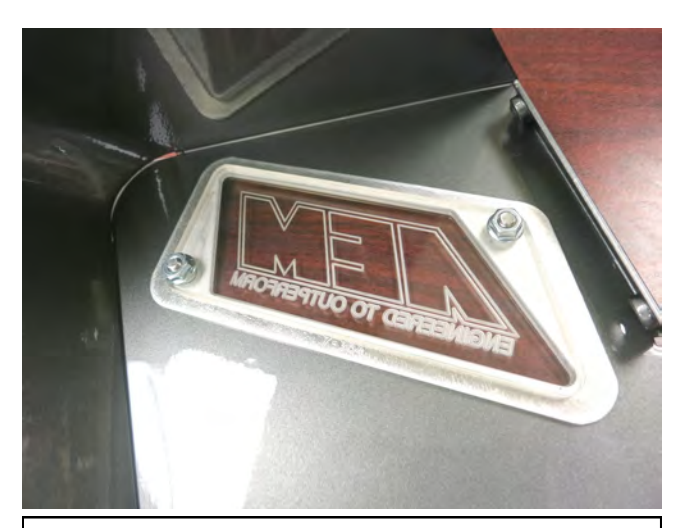
c. Install the clear AEM plate. Make sure to install the aluminum offset spacer in between the air box and plate.