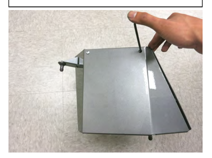
g. Install the two halves of the air box together. Due to variances in the manufacturing process, slight misalignments between the holes and threaded nut-serts may be present. You can align one hole with a small screwdriver while tightening the adjacent hole.