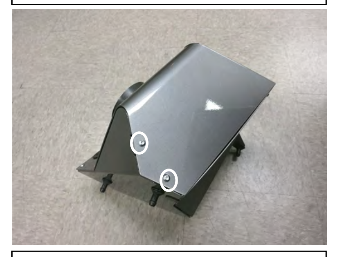
i. Install [2] bolts shown above.