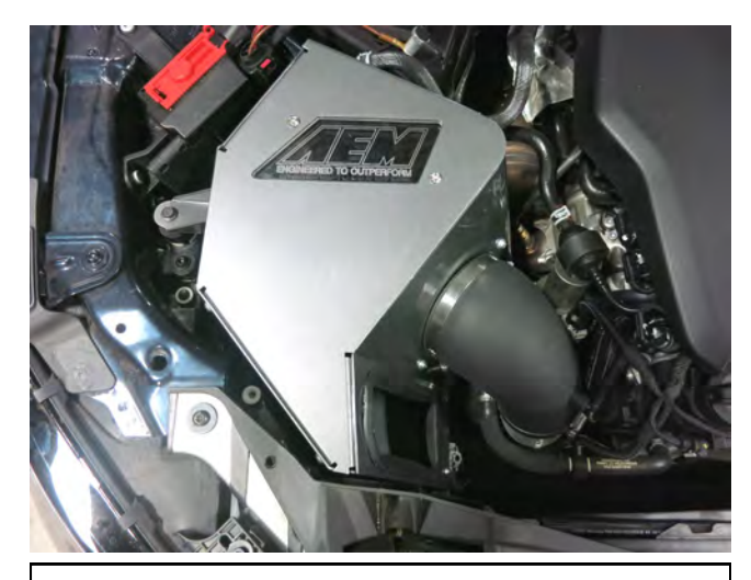
I. Place the air box into the engine bay. Align the [3] push-in studs and make sure they seat into their respective grommets. Make sure the coupler is fully seated onto the turbo inlet then tighten both hose clamps.