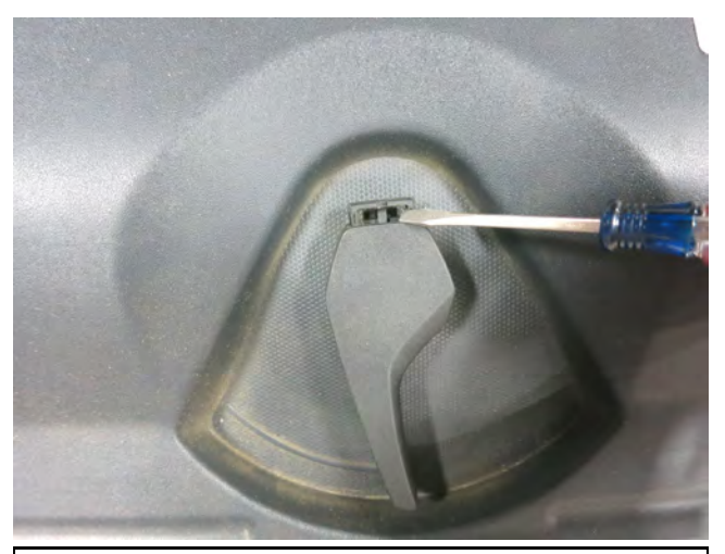
a. Use a small flat head screwdriver to pull out the retaining clip and remove the hood release lever.