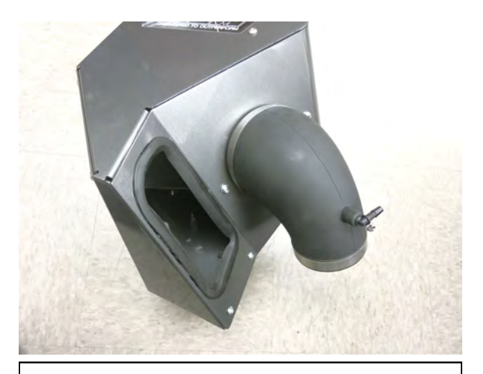
k. Loosely install the coupler with hose clamps. Then install the vacuum fitting into the coupler.