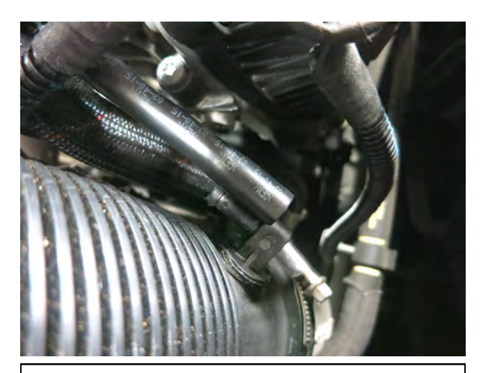
e. Pull the small vacuum line from the nipple on the intake pipe.