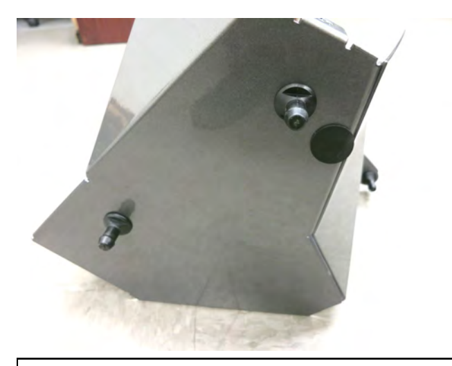
b. Install the remaining studs on the bottom of the lower half of the AEM air box. Then apply the rubber adhesive pad in the approximate location shown.