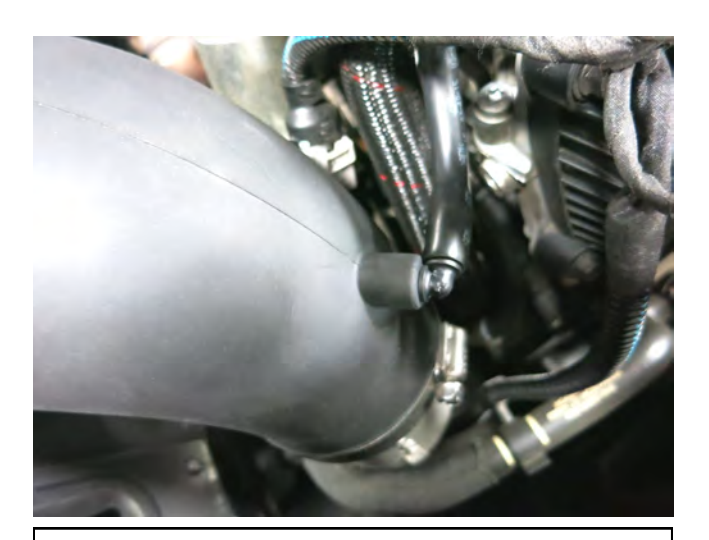
m. Install the vacuum hose onto the fitting.