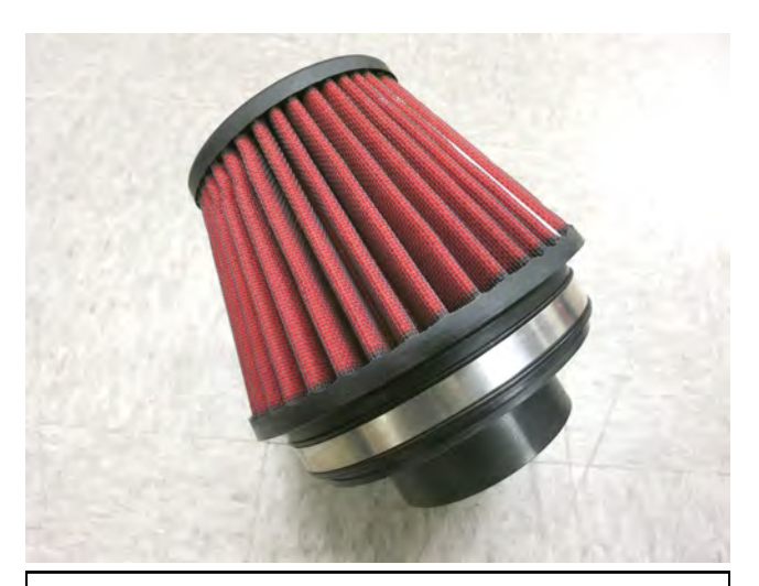
d. Install the AEM filter onto the velocity stack with the supplied hose clamp.