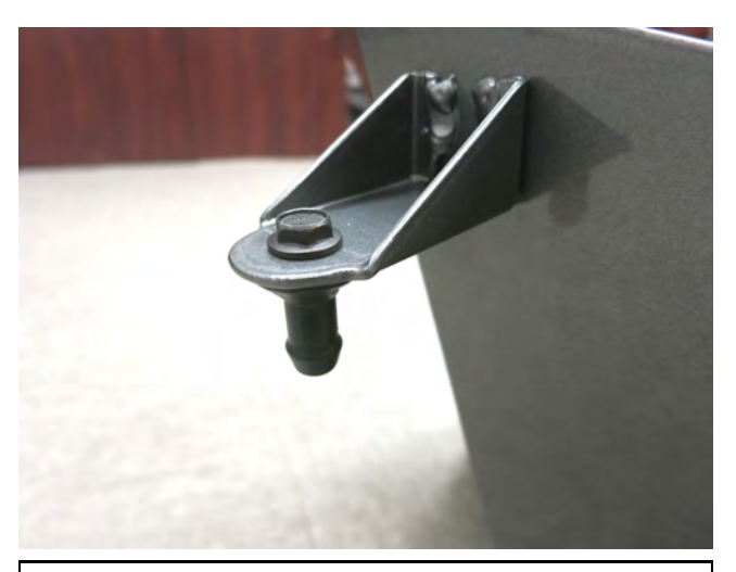
a. Install the push-in stud on the mounting bracket as shown.

a. When installing the intake system, do not completely tighten the hose clamps or mounting hardware until instructed to do so.