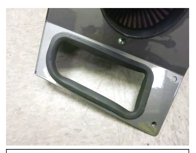
f. Install the rubber gasket removed in step 2g.