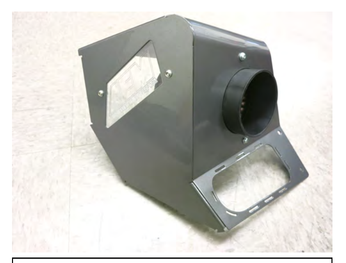
e. Install the AEM filter with velocity stack onto the air box. Refer to the exploded view for the appropriate hardware.