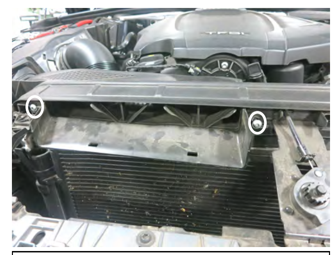
c. Remove the [2] T25 Torx screws shown above and remove the air inlet scoop.