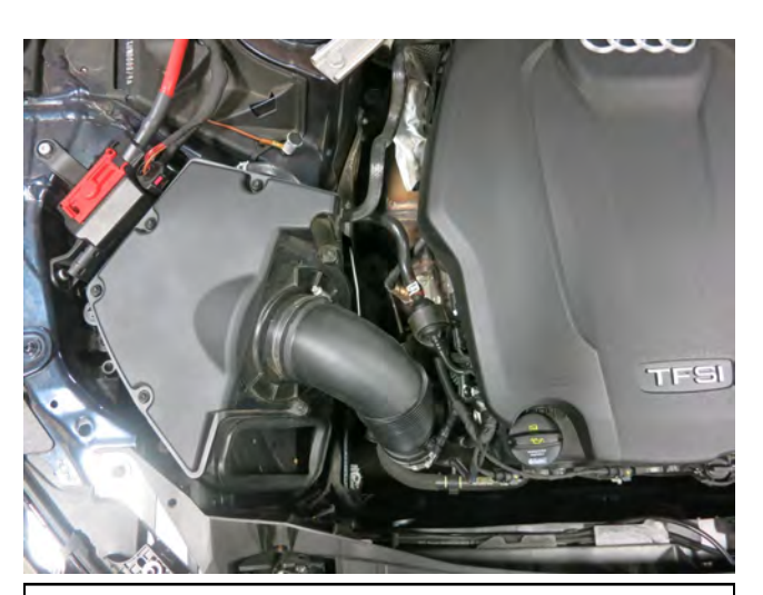
d. Loosen the hose clamp on the intake pipe at the turbo inlet.