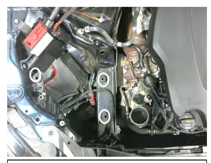
f. Pull up on the air box and remove it. Ensure the [3] grommets shown above are still in place. Do not discard any factory components or hardware.