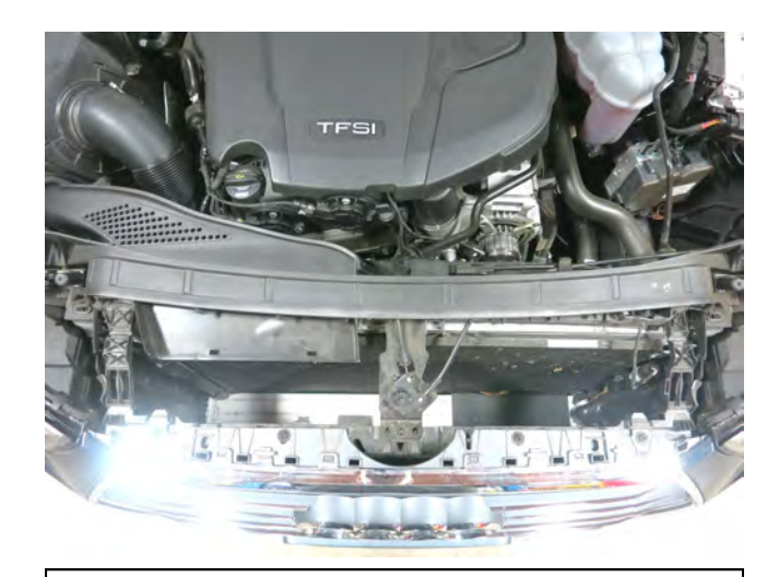
b. Carefully pull the radiator shroud out.