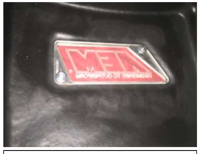
b. Install the AEM logo plate with the [2] M6 X 16mm button-head bolts and nuts.