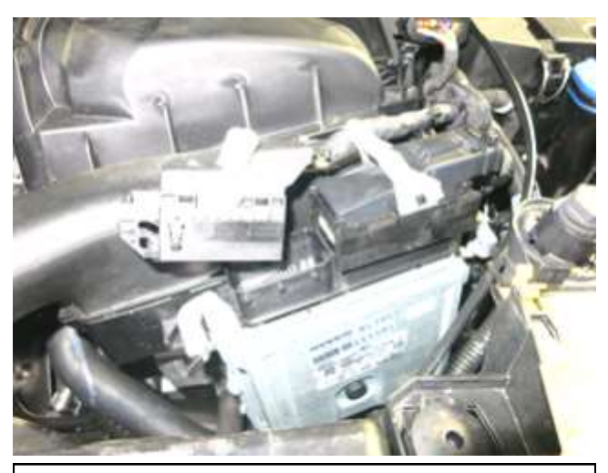
d. Pull on the [2] latches to release the [2] ECU harness connectors.

b. Use a 7mm socket driver to loosen the turbo inlet hose clamp. Separate the turbo inlet hose from the air box outlet.