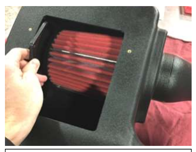
c. Insert the AEM filter with the retaining bracket into the air box as shown.