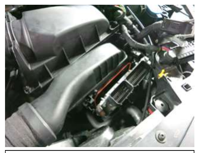
e. Release the [2] clips and pull the ECU from the stock air box. Carefully set this aside.