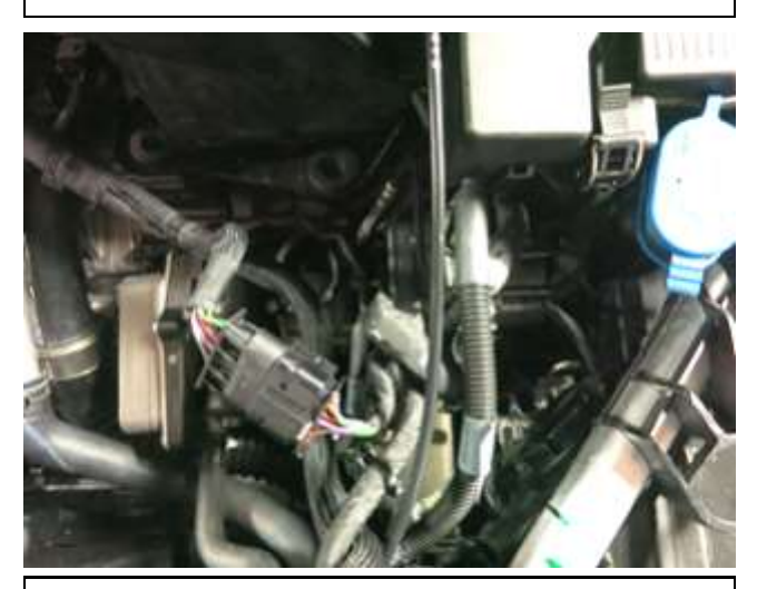
j. Route the ECU harness underneath the main fuse box harness and hood release cable (as shown above). Reconnect the connector disconnected in the previous step.

h. Fasten the assembled mounting bracket over the ECU and onto the underside of the air box.