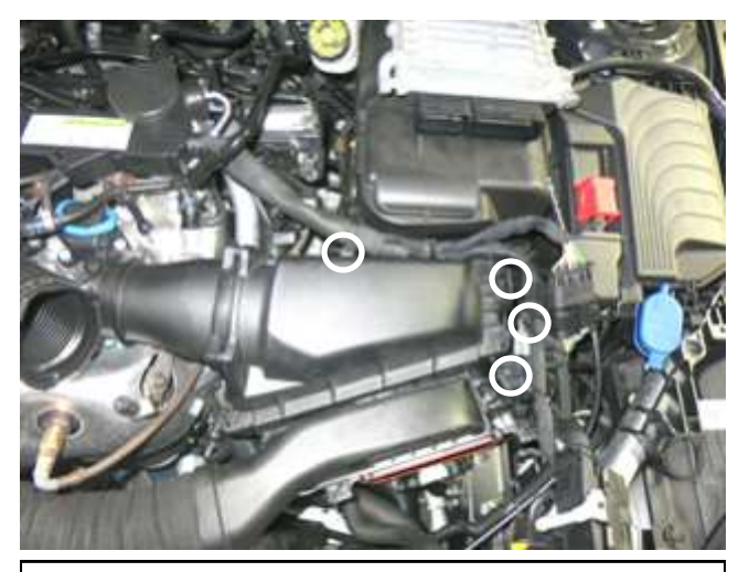
f. Unclip the ECU harness from the [4] locations shown and move it aside.

g. Pull the stock air intake system from the vehicle. Make sure the [3] grommets are still seated in the engine bay and not stuck to the air box. Do not discard any factory components.