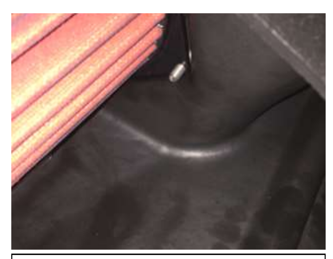
d. Align the threaded holes in the retaining bracket to the holes in the air box. Fasten with the [3] M6 X 25mm bolts until about 1/2" of the bolt protrudes from the retaining bracket.