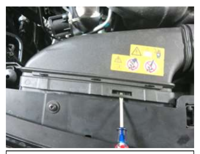
c. Use a flat-head screwdriver to separate the intake duct from the air scoop.

a. Carefully pull up on engine cover and remove it from the engine bay.