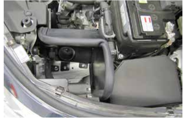
11. Install coupler (08284) onto the heat shield and secure with the provided hose clamp. Set the heat shield assembly onto the inner fender and secure with the hardware provided.