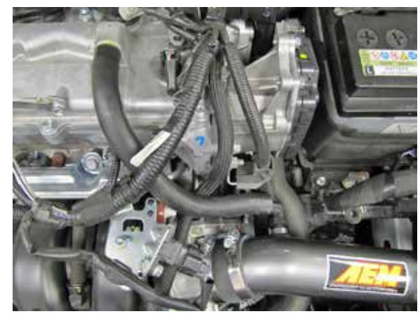
18. Install the provided crank case vent hose onto the fitting on the intake tube and then onto the fitting on the valve cover.