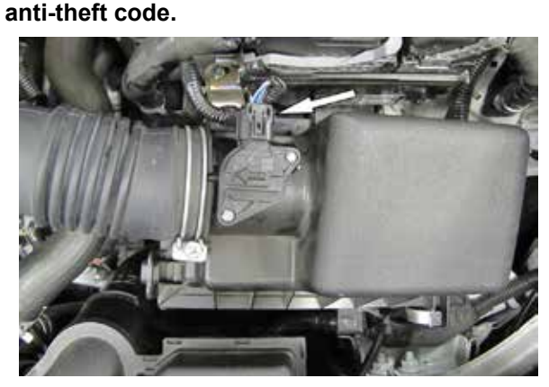
2. Disconnect the mass air sensor electrical connection.

NOTE: Disconnecting the negative battery cable erases pre-programmed electronic memories. Write down all memory settings before disconnecting the negative battery cable. Some radios will require an anti-theft code to be entered after the battery is reconnected. The anti-theft code is typically supplied with your owner's manual. In the event your vehicles anti-theft code cannot be recovered, contact an authorized dealership to obtain your vehicles