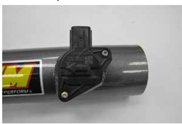
15. Remove the mass air sensor from the factory air filter housing and install it into the AEM® intake tube and secure with the provided hardware.

NOTE: Plastic NPT fittings are easy to cross thread. Install the vent fitting "hand" tight, then turn it two complete turns with a wrench.