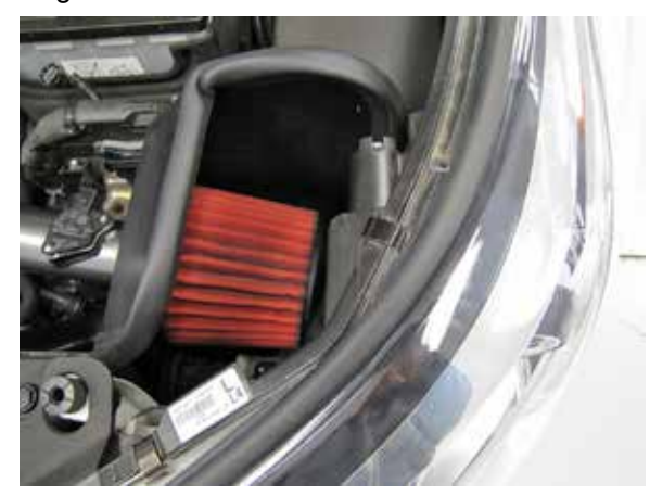
19. Install the AEM® air filter and secure with the provided hose clamp.

NOTE: Flex the heat shield to allow clearance for the air filter install