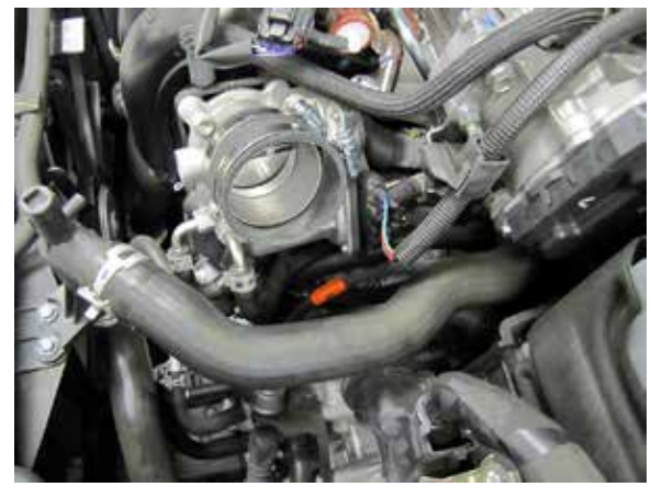
12. Install the provided coupler (08284) onto the throttle body and secure with the provided hose clamp.