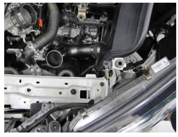
13. Install the fresh air intake tube into the coupler at the heat shield but do not completely tighten the hose clamp at this time to allow some adjustment.