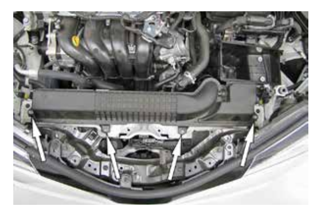
7. Remove the four bolts that secure the fresh air inlet duct and then remove the duct from the vehicle.