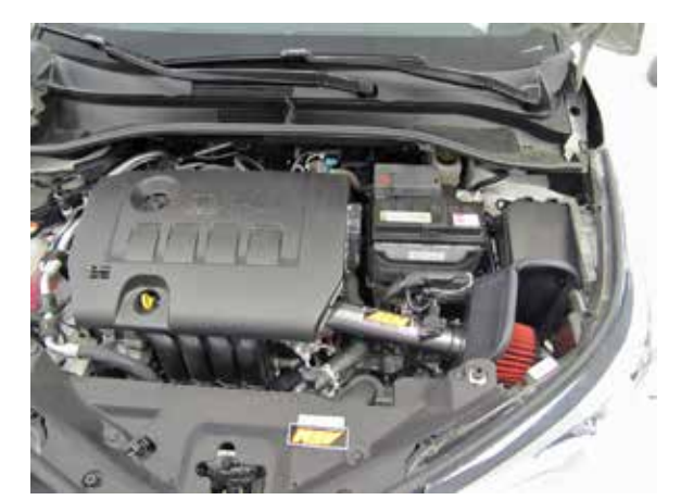
22. Reinstall the core support cover and secure with the factory hardware. Reconnect the negative battery cable.