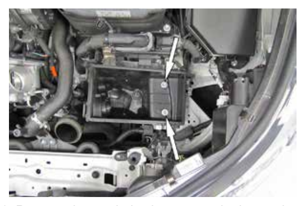
8. Remove the two bolts that secure the lower air filter housing and then remove the housing from the vehicle.