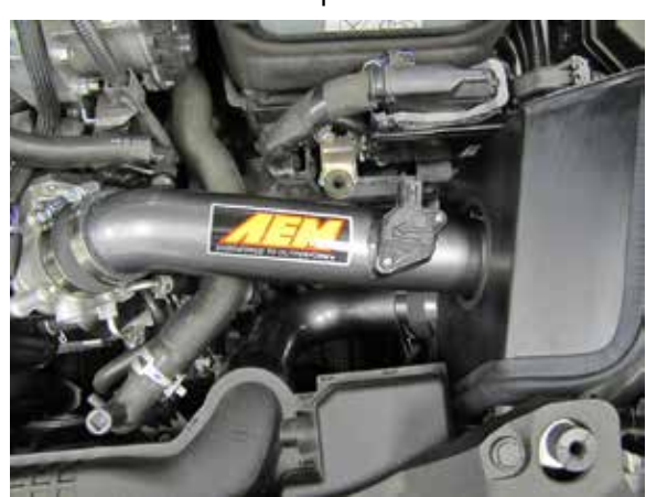
16. Install the AEM® intake tube through the heat shield and then into the coupler at the throttle body, adjust the tube for best fit and then secure with the provided hose clamp.