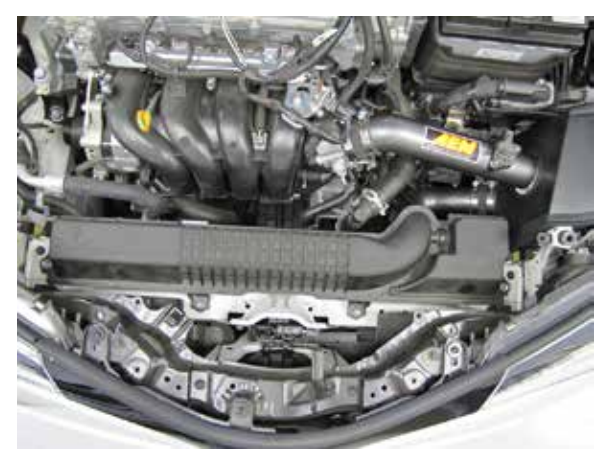
17. Install the factory fresh air intake and align the AEM® fresh air intake tube. Secure the factory fresh air intake with the factory bolts and secure the AEM® fresh air tube with the hose clamp provided.