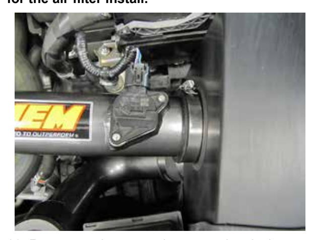
20. Reconnect the mass air sensor electrica connection.

NOTE: Flex the heat shield to allow clearance for the air filter install