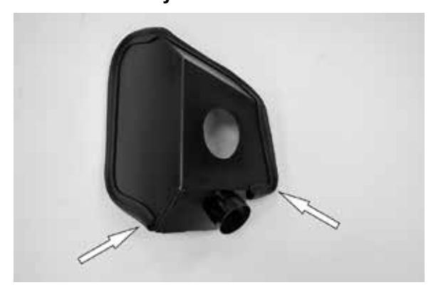
9. Install the provided edge trim around the heat shield. Some trimming of the edge trim will be necessary.