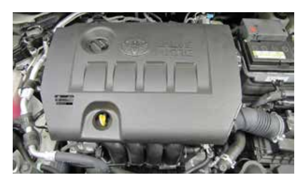
3. Lift up the decorative engine cover to release it from the mounting grommets and then remove from the vehicle.