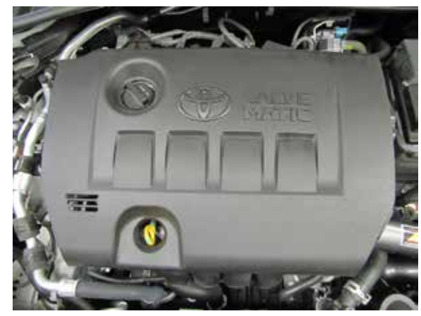
21. Reinstall the decorative engine cover.