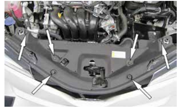
6. Remove the four plastic retaining clips and two hood stops and then remove the core support cover.