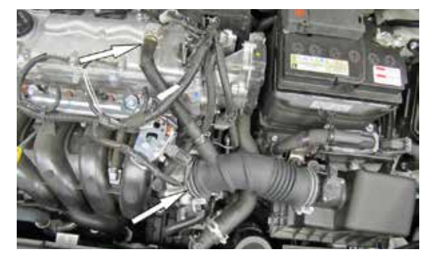
4. Loosen the hose clamp that secures the intake tube to the throttle body. Release the spring clamp that secures the crank case vent hose to the valve cover port and then disconnect the crank case vent hose.