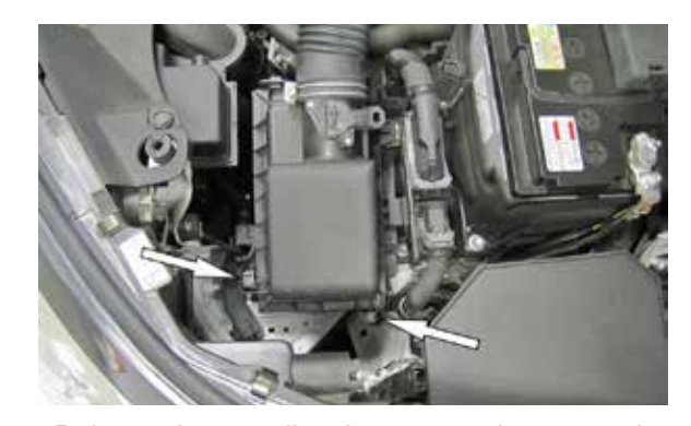
5. Release the two clips that secure the upper air filter housing, then remove the upper housing with the intake tube and crank case breather hose. Remove the factory air filter.