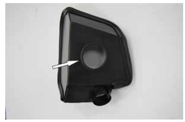
10. Install the provided edge trim inside the hole of the heat shield.