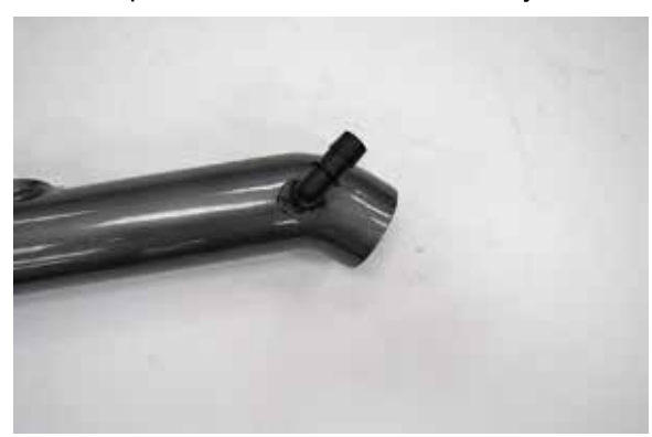
14. Install the provided 90° vent fitting into the intake tube as shown.

NOTE: Plastic NPT fittings are easy to cross thread. Install the vent fitting "hand" tight, then turn it two complete turns with a wrench.