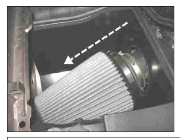
a. Remove air filter.