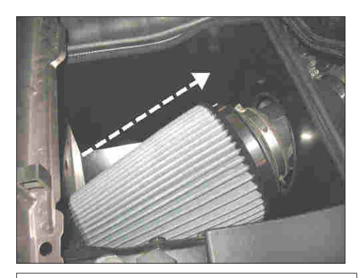
e. Reinstall the air filter onto vehicle. Proceed to step 3.