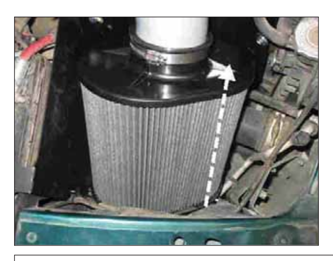
f. Reinstall filter onto vehicle.