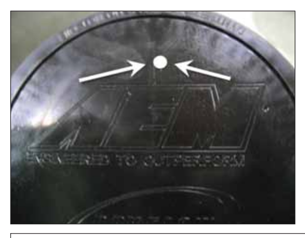
b. Drill 1/8" hole in lid of filter. Make sure no debris from the drilling operation gets inside the filter.