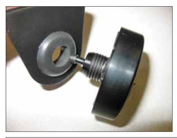
b. Push barbed filter minder nipple into grommet. Lubricate the grommet hole.