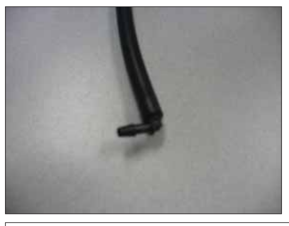
d. Push one end of 5/32" hose onto exposed end of elbow.