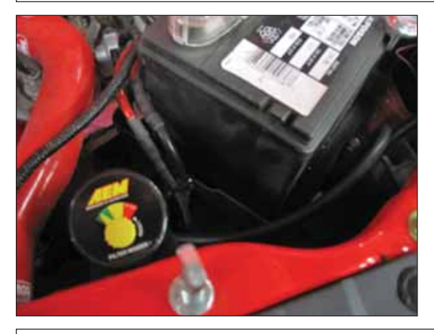
c. Mount under hood in a suitable location using the enclosed bolts and nuts. Alternatively, you may also use zip ties or another method to securely attach the filter minder remote mount assembly to the vehicle. See images for step 3c and 3d as examples for mounting the filter minder