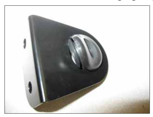
a. Install 3/4" grommet in remote mount bracket.