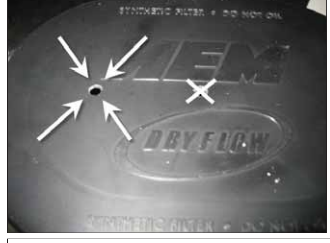
b. Drill 15/64" hole in lid of filter in the specified location.