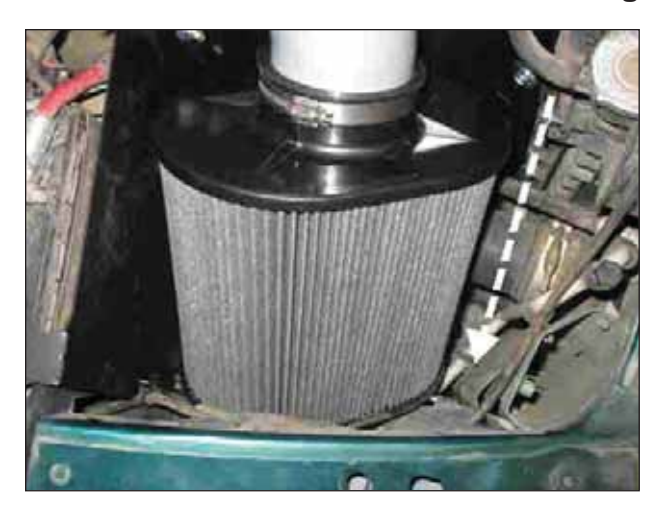
a. Remove air filter.