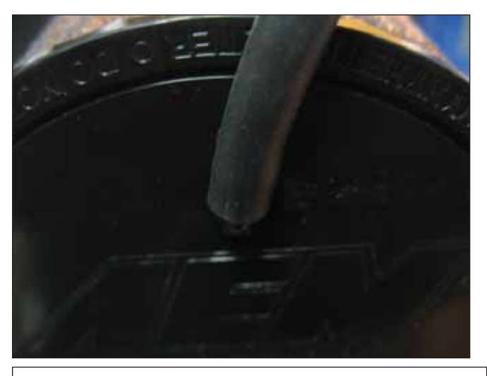
d. Push one end of 5/32" hose onto exposed end of elbow.