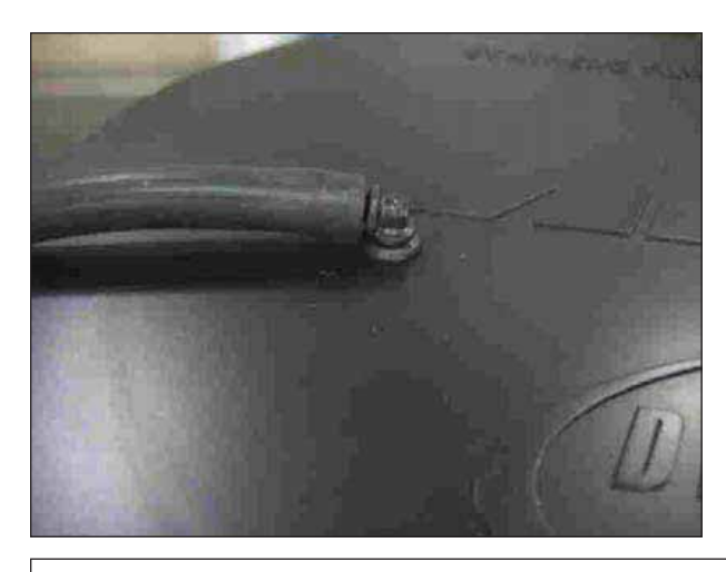
e. Push one end of 5/32" elbow into grommet. Again, you may want to use soapy water to lubricate grommet.