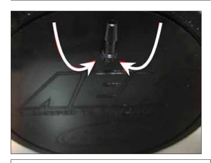
c. Insert one end of 5/32" elbow into hole.