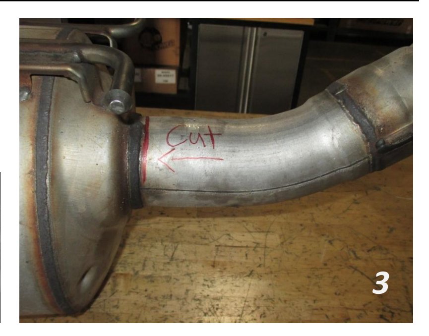
Page 1 of 2