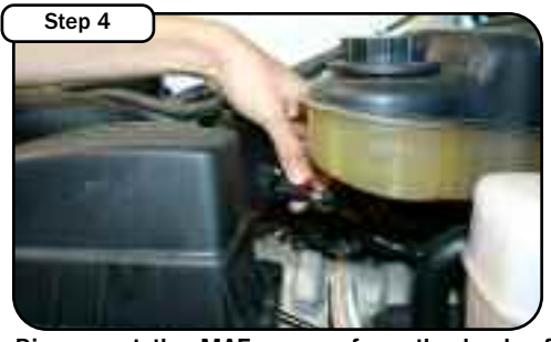
Disconnect the MAF sensor from the back of the air box.