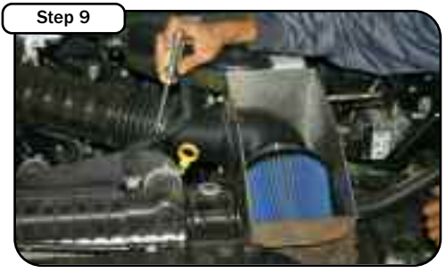
Place assembly into the lower portion of the air box. Tighten the hose clamp on the intake duct.