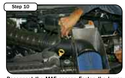
Reconnect the MAF sensor. Fasten the lower air box clips to the new housing.