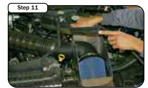
Place the trim seal along the edge of the housing. Start at one end and work you're way around the edge.