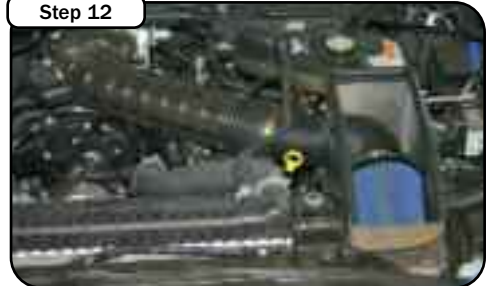
The installation is now complete. Check all electrical connections and tighten all clamps. Periodically check all connections.

NOTE: Retighten all connections after approximately 100-200 miles. Place the included CARB EO sticker on or near the device on a smooth, clean surface. EO identification label is required to pass the smog inspection.