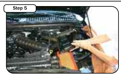
Remove the air box and factory air filter.