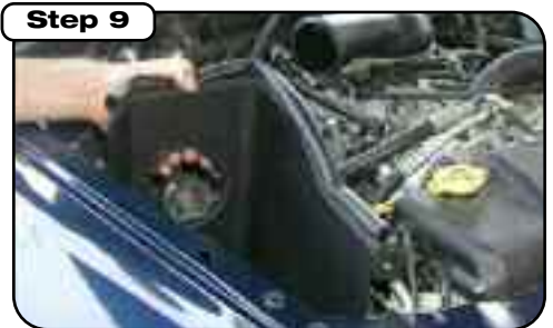
Before installing housing place large trim on top edge of filter housing and small trim on around small hole in housing. Mount filter housing using hardware A, B (supplied) and C from step 8.