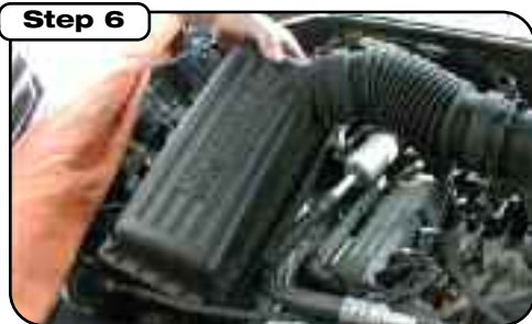
Pull out OE intake system from the rubber mounts. Pull upward.