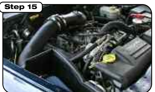
Place enclosed CARB EO sticker on a clean/smooth surface on or near the intake system. EO identification label is required in passing Smog Check inspection. Make sure all hoses and clamps are tight and that all electrical components are secure.