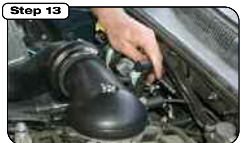
Slip vent breather hose onto cap nipple.