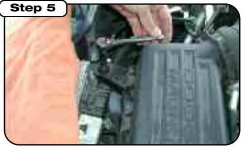
Loosen and remove bolt (one only) from OE filter box.