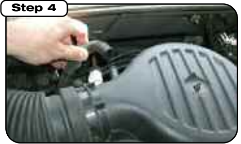
Remove vent hose from OE throttle body cap.