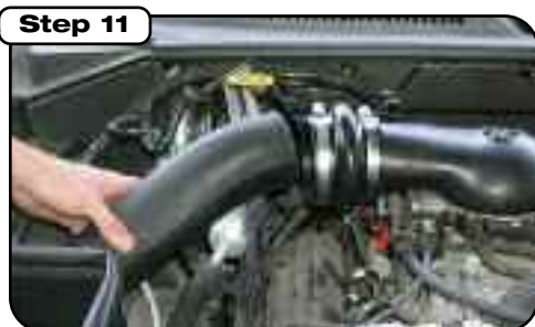
Install intake tube by sliding through housing first and then into hump coupler.