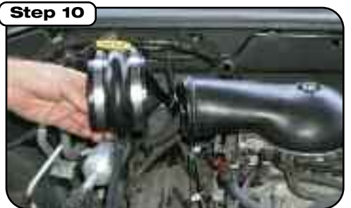
Install hump coupler to throttle body cap. Tighten clamp at cap side only.