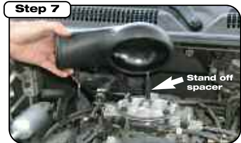
Install throttle body cap stand off spacer (arrow) and cap. Keep original throttle body gasket. Tighten with wingnut.