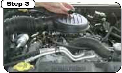
Remove cap nut from top of hat.