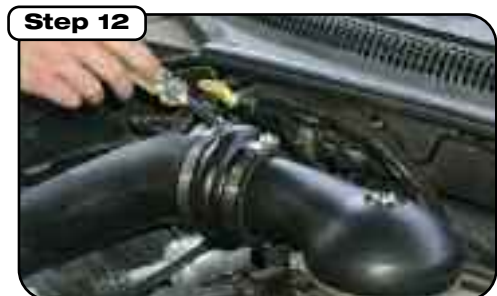
Tighten clamp at intake tube side of hump coupler. DO NOT OVER TIGHTEN.