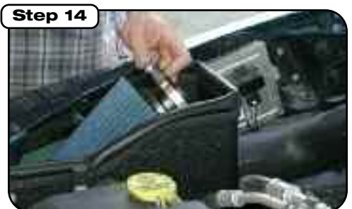
Install filter onto intake tube and tighten clamp. DO NOT OVER TIGHTEN.