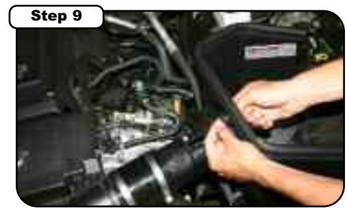
Slide the intake tube assembly into the housing . Secure the tube to the housing with the supplied M6 hardware. Tighten and secure the hose clamp.