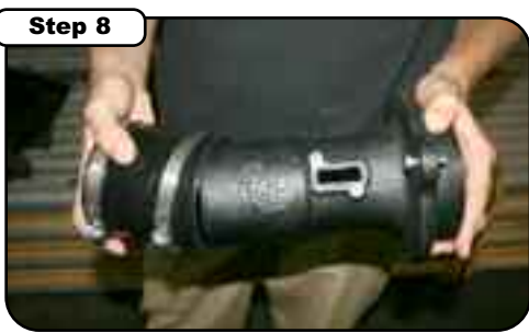
Place the coupler on to the intake tube. Do not tighten clamps at this time.