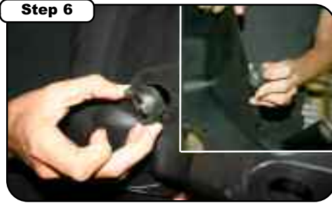
Transfer the rubber vibration mounts located on the bottom of the air box over to the new housing.

Remove the 10mm bolt on the side of the air box set aside for later use. Lift the lower air box up and out of the engine bay.