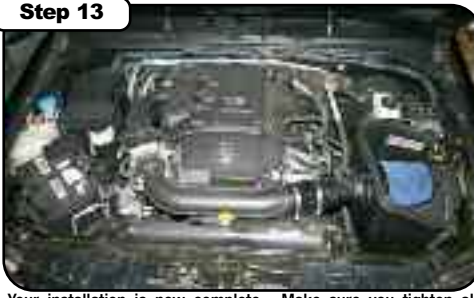
Your installation is now complete . Make sure you tighten all clamps and check all electrical connections. Re check periodically.