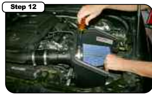
Install the pre oiled air filter. Do not use any grease or oil. Secure with the provided clamp.