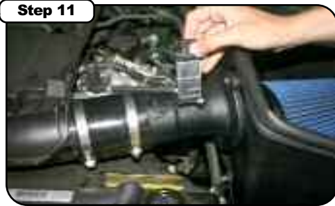
Transfer the MAF sensor to the aFe intake tube. Secure with the supplied gaskets, spacers, and screws. Make sure you pay attention to the direction of the arrow on the MAF sensor.

Carefully remove the MAF sensor from the OEM air box lid.