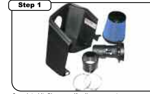
Complete kit. Please verify all components are present prior Complete stock intake. to beginning installation.