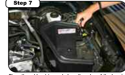
Place the rubber trim seal along the edge of the housing. Lower the housing into the engine bay secure housing with the bolt removed in step 5.