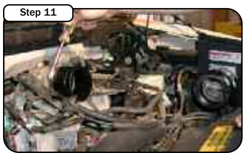
Install the hump coupler and clamps on the air filter housing and install the 3" straight coupler and clamp on the throttle body