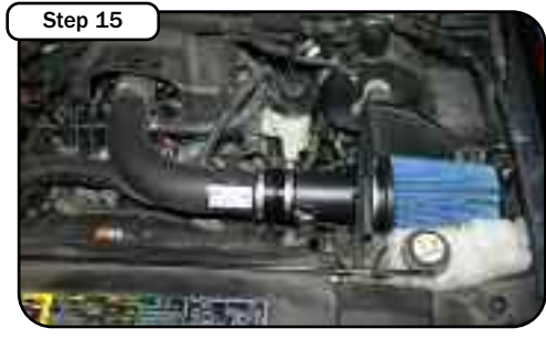
Place enclosed CARB E0 sticker on a clean/smooth surface near the intake system. E0 identification label is required to passthe smog test inspection. Your installa-tion is now complete. Close hood slowly to verify hood clearance. Check and retighten connections and filter after a few hours of operation.