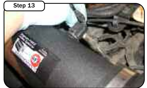
Install the rubber grommet into the IAT sensor location.Reinstall the IAT sensor and reconnect harness. At this time plug the MAF sensor into the harness and secure harness on the side of the housing with the included mount-ing holes. If you do not have a IAT sensor use the provided grommet and cap to seal the opening.