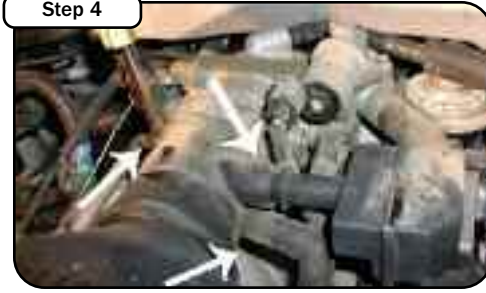
Loosen the factory hose clamp on the throttle body,and the 3/4" idle air bypass hose and the 5/8" breather hose.On some 04-05 models the IAB is not present.