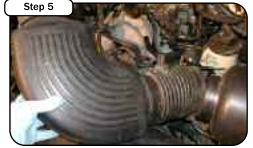
Unplug the IAT sensor and remove the intake duct from the engine.On some 04-05 models the IAT sensor is not present.