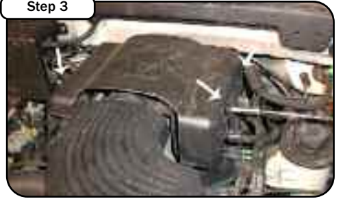
Remove the three 10mm bolts holding the throttle body cover..