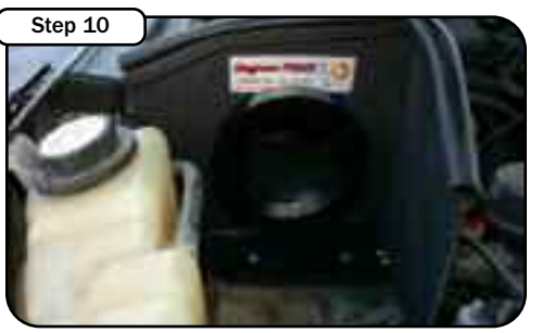
Insert the air filter housing into the engine bay and bolt down the housing to the bottom bracket with the suplied nuts and bolts.Re install the 8mm bolt that secures the cruise control.