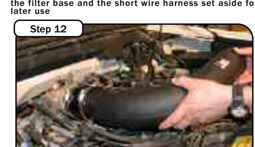
Install the smaller end of the intake tube into the throttle body coupler and insert other end into the hump coupler on the housing. Tighten down clamps on both couplers.