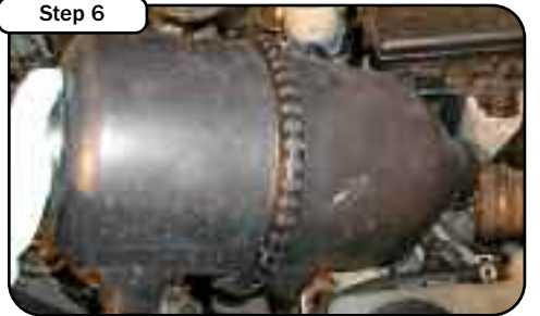
Lift air filter housing by pulling straight up it is held in place with 2 rubber gromets. On the back side is of the canister is the MAF harness. Unplug harness form vehicle and remove. Save items for future use if needed.