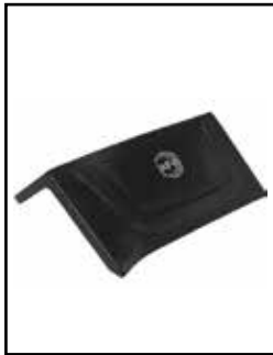
Intake System Cover