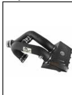
Magnum Force Intake