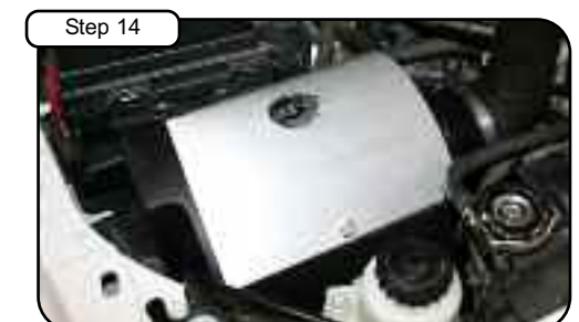
Install housing cover and tighten using thumb screws