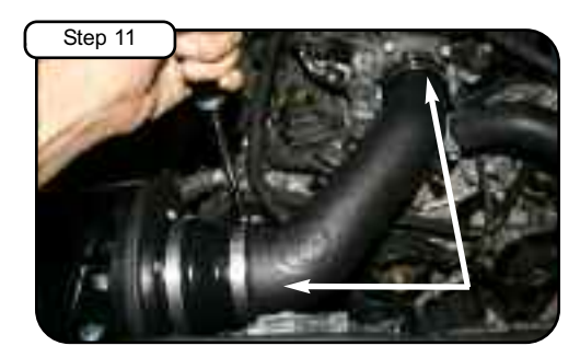
Install tube to throttle body and housing. Tighten clamps using 5/16" nut driver.