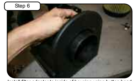
Install filter adaptor to inside of housing using button head screws and wavy washers.