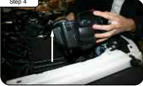
Carefully remove bottom half of airbox. (caution, this may require some force)