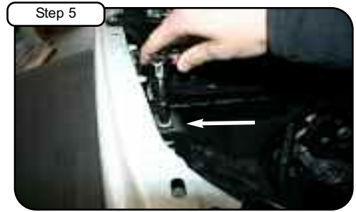
Loosen 10mm bolt holding in airbox bracket. Save for later install.