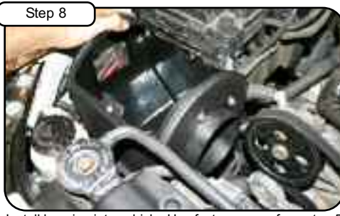
Install housing into vehicle. Use factory screw from step 5 to mount tab on new housing.