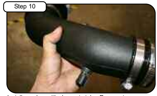
Install couplers with clamps to tube. Remove temp sensor from OE intake tube and install into new tube using grommet provided.