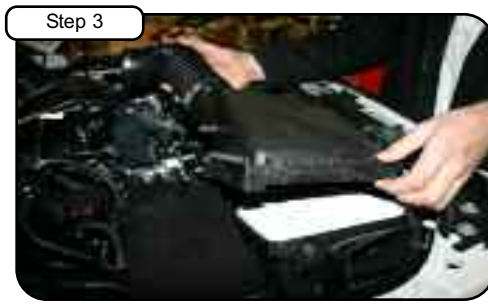
Disconnect crank case line at OE airbox. Disconnect OE clips holding in upper half of OE airbox. Remove upper half of airbox from vehicle.