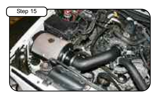
Place enclosed CARB EO sticker on a clean/smooth surface on or near the device. EO identification label is required in passing the Smog Check Inspection. Your installation is now complete. Please check all bolts and clamps periodically. Re-tighten if necessary. Thank you for choosing aFe!