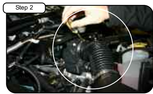
Loosen clamp using 5/16" nut driver at throttle body.