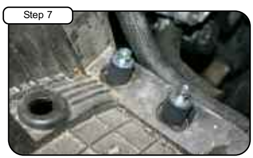
Remove the 2 factory rubber grommets. Install isolation mounts to OE mounting position. Use nuts and washers provided. Tighten using 9/16" socket or wrench.