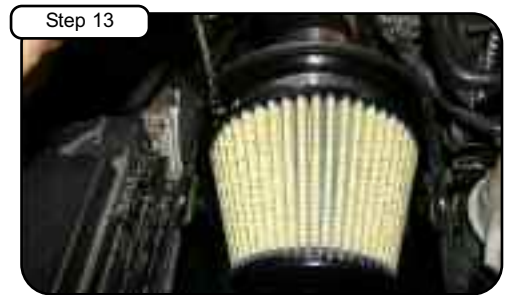
Install air filter and tighten using 5/16" nut driver.