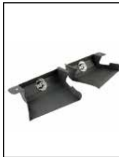
Dynamic Air Scoops