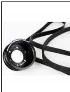
Power Pulley (2007-2008.5)