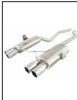
Cat Back Exhaust (E92/93)