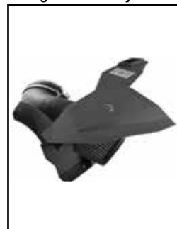
Stage 2 Intake System