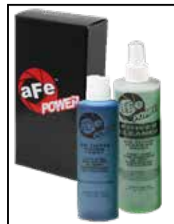
Blue Squeeze Restore Kit