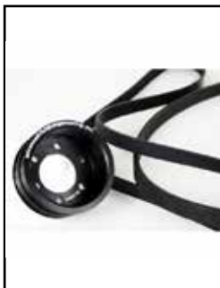
Power Pulley (2009-2013)