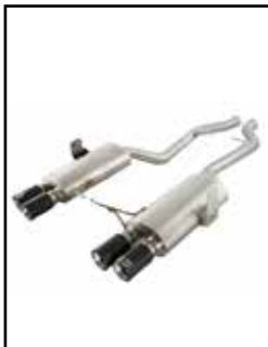
Cat Back Exhaust (E90)