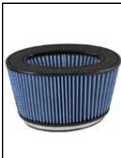
Pro 5R Air Filter