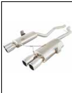
Cat Back Exhaust (E90)