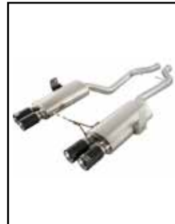
Cat Back Exhaust (E92/93)