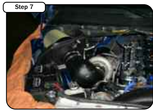
Your installation is now complete. Make sure all clamps are tight and that all electrical components are secure. Check and retighten connections after a few hours of operation.