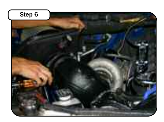
Tighten all the clamps snug but do not overtighten.