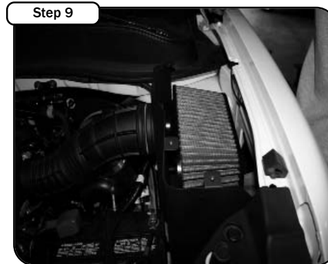
Step 9 Install intake filter into housing. Do not use any grease or oil to install air filter