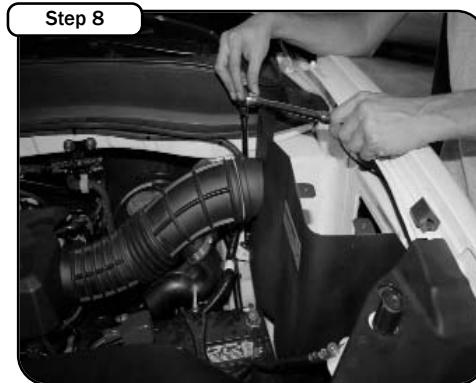
Step 8 Secure housing with supplied bolts and washers. Connect intake duct to the housing.