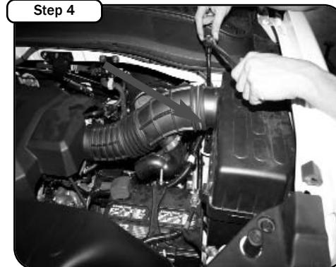
Step 4 Remove the 10mm bolt securing the back of the air box.