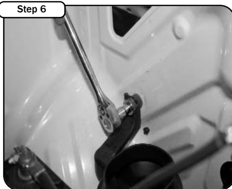
Step 6 Loosen but do not remove the bolt securing the air intake snorkel.