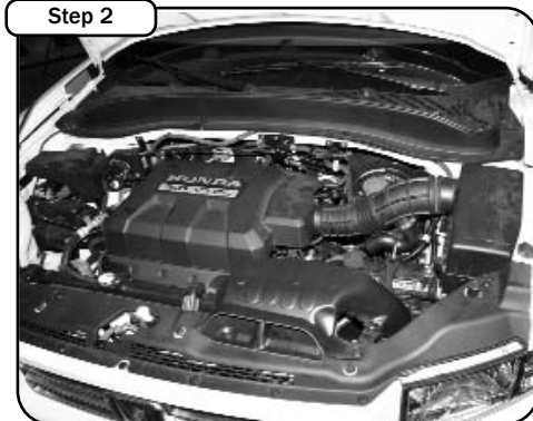
Step 2 Complete stock intake.