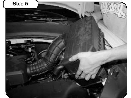
Step 5 Remove the airbox assembly out of the engine compartment.