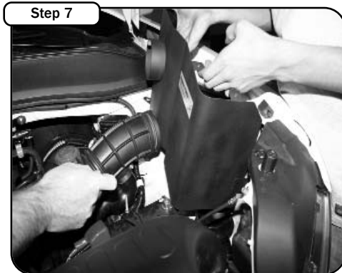
Step 7 Position the new housing inside the engine compartment. Make sure the lower mounting tab slide in the snorkel mount.