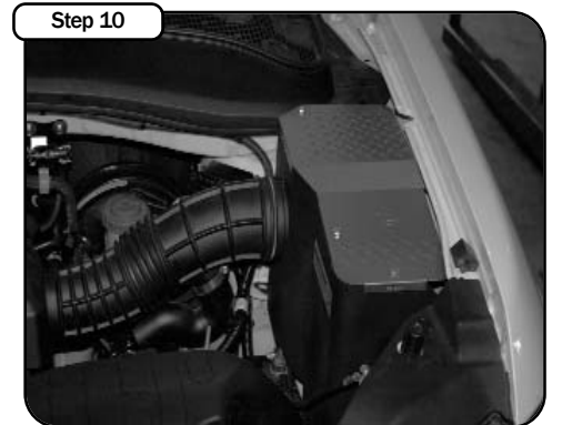
Step 10 Install the aluminum cover and secure with the supplied button head screws. Your installation is now complete. Make sure you tighten all clamps and check all electrical connections. Re-check periodically.

Place enclosed CARB EO sticker on a clean/smooth surface on or near the intake system. EO identification label is required in passing the Smog Check Inspection.