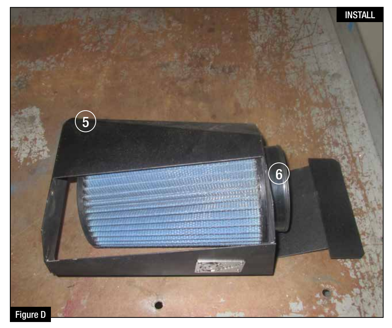
Refer to Figure D for step 5