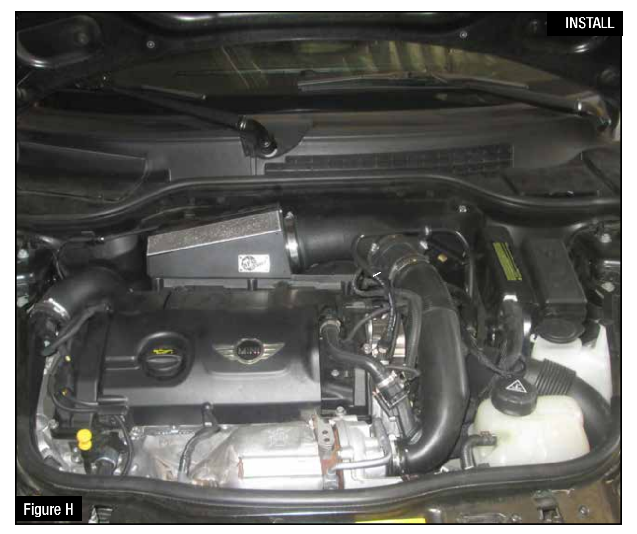
Refer to Figure H for step 12

Step 12. Make sure all clamps and screws are tightened. Installation is now complete, recheck clamps and screws after 200 miles.