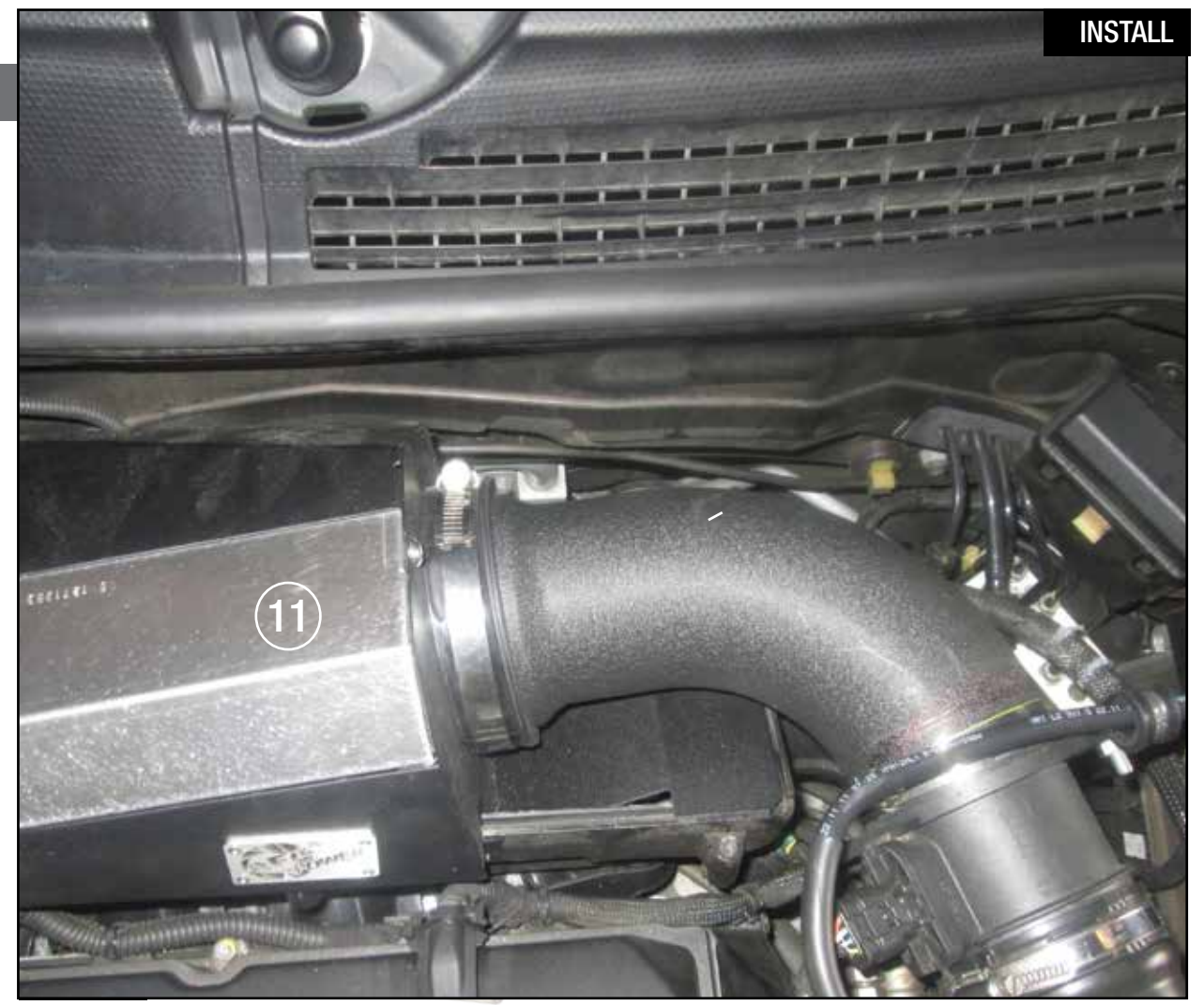
Refer to Figure G for step 10