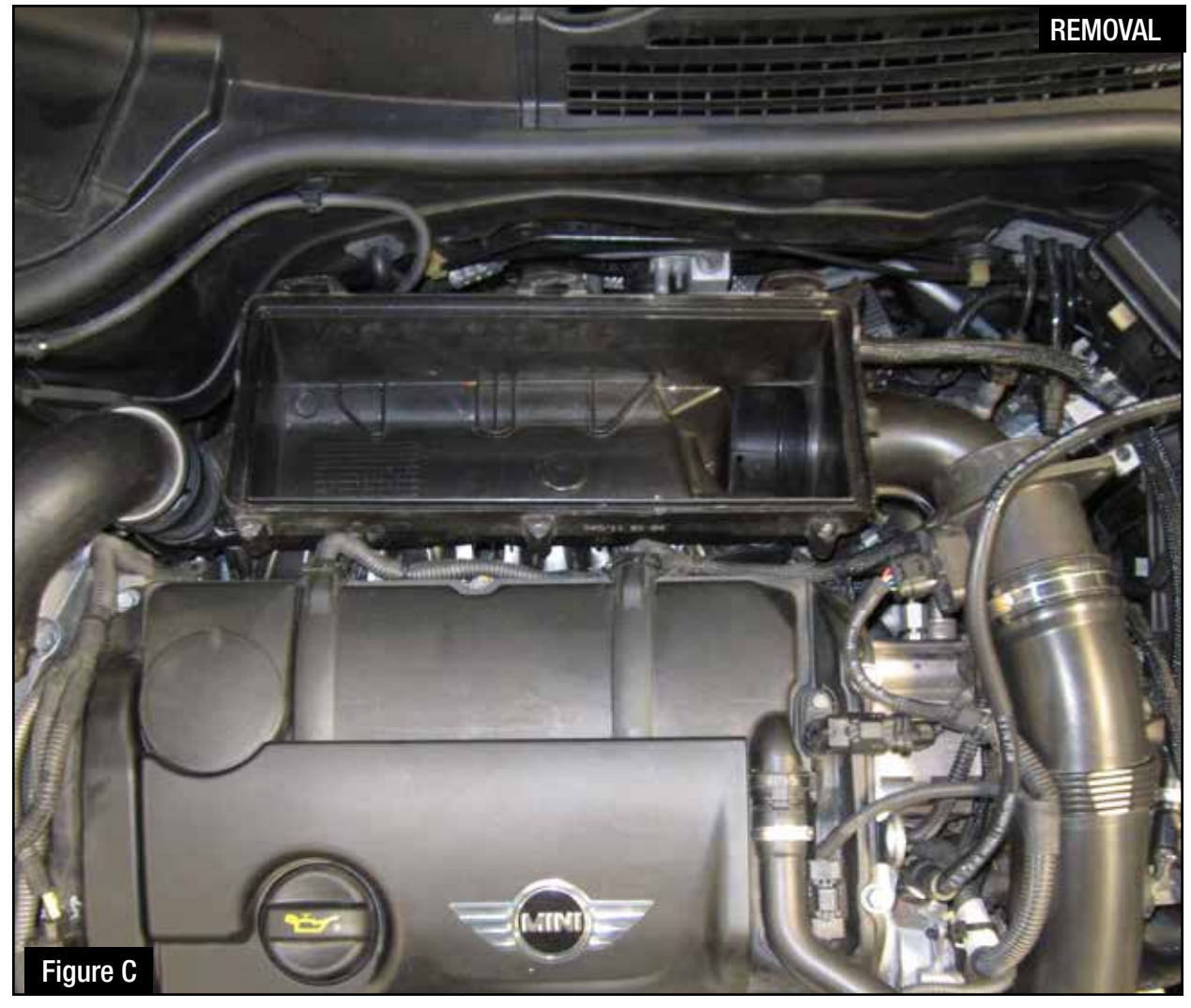
Refer to Figure C for step 4

Step 4. Now remove the top portion of the intake housing and filter as shown.