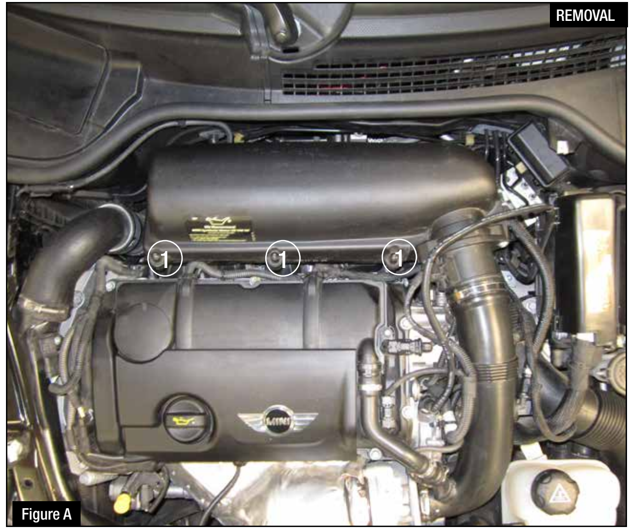
Refer to Figure A for step 1

Step 1. Remove the 3 screws that are holding down the top portions on the stock intake housing ① .