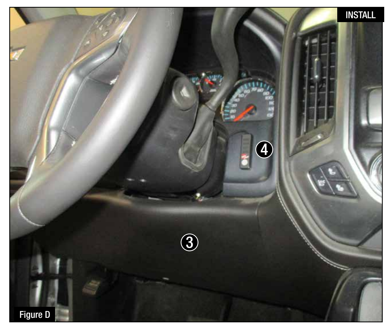
Refer to Figure D for Step 7.