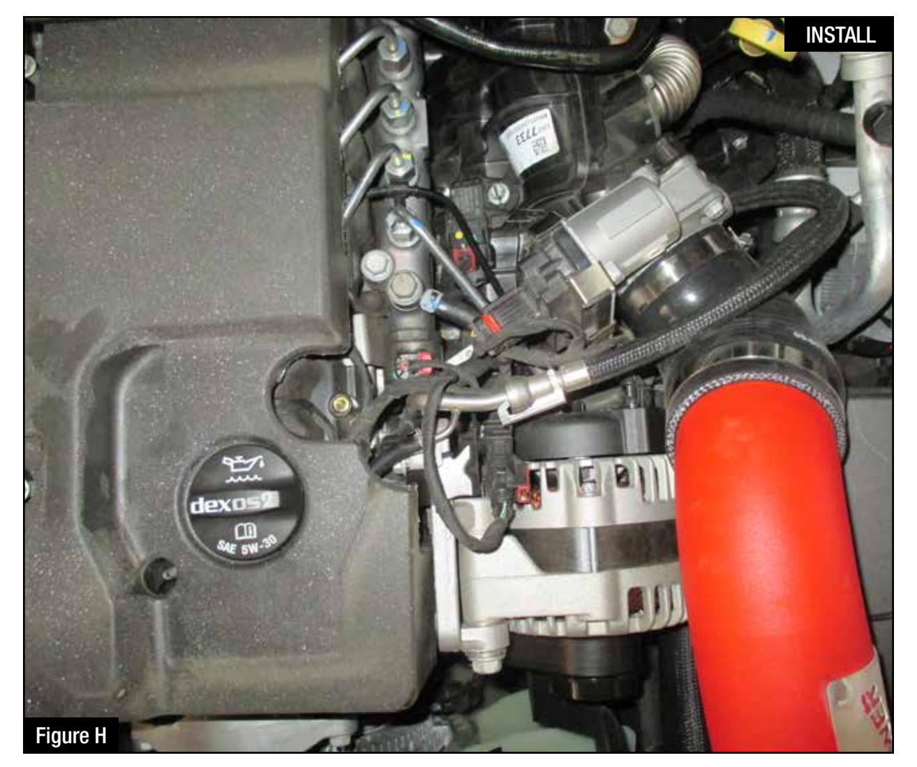
Refer to Figure H for Step 12.