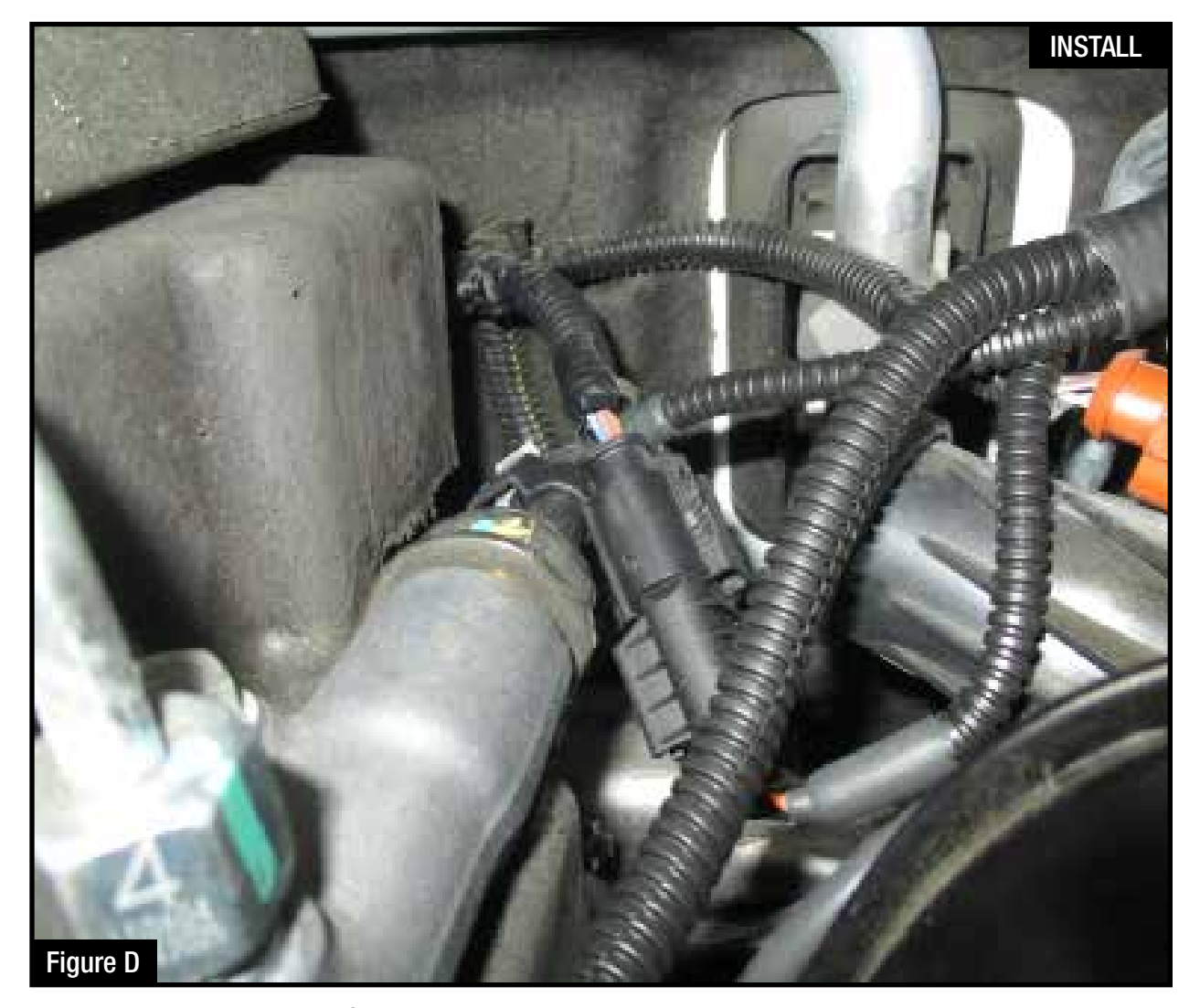
Refer to Figure D for Step 6.

Step 6: Check with the pictures to make sure the connectors are correctly connected.