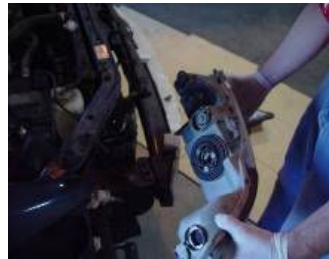
Now your headlight should be able to come right out.