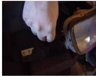
Step 11: Twist off the Turn signals in the headlight.