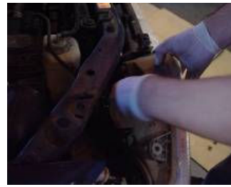
Step 12: Twist off the headlight bulbs.