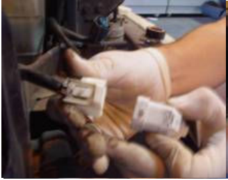
Step 13: Unclip the head light wire harness from the bulbs.