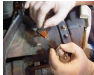
Step 14: Remove the parking light from the wire harness.