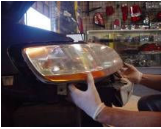
Step 10: Now remove the headlight from the frame.