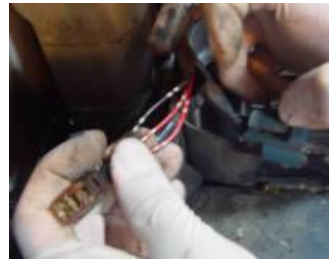
Step 16: Splice the two red wires from the new headlight to the black and red wire to power the halos.