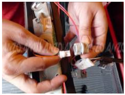
Step 5: Plug our ne third brake light in orginal bulb socket