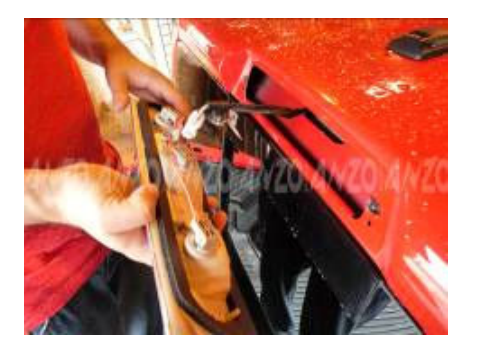
Step7: Twist the two cargo blubs into the new Anzo light.