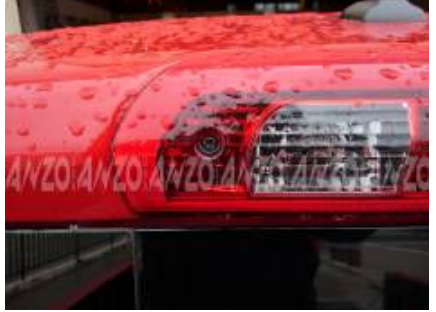
Step 1: Locate the two phillips screw on both ends of the third brake light and remove