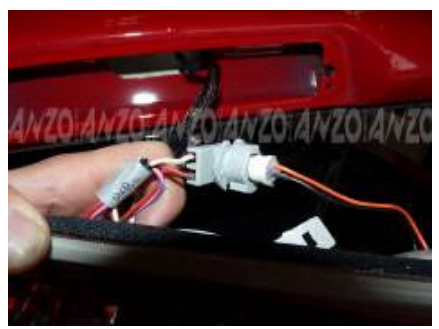
Step 6: When connecting our new Anzo third brake light make sure orange wire lines up with the white/yellow wire and black to red/green wire