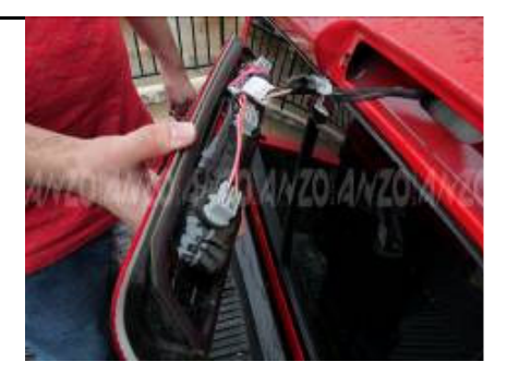
Step 2: Take off the the vehicle.