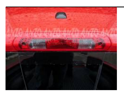
Tools Needed: Phillips screwdriver.

Read complete ins before installa Improper installa void warra