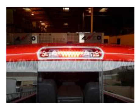
Step 8: Test all fun proper installation I driving.

AnzoUSA<sup>™</sup> products are covered, by a limited one (1) year warranty, to be free of manufacturer's defects. However, certain AnzoUSA<sup>™</sup> product categories have warranty policies which differ from this standard, please contact your representative for detailed category information. Damage due to improper installation or road hazards is not covered. Seller and manufacturers' only obligations shall be to replace the product proven to be defective. Neither seller nor manufacturer shall be liable for any injury, loss or damage, direct or consequential, arising out of the use of or the inability to use the product. Before using, user shall determine the suitability of the product for its intended use, and user assumes all risk and liability whatsoever in connection therewith.