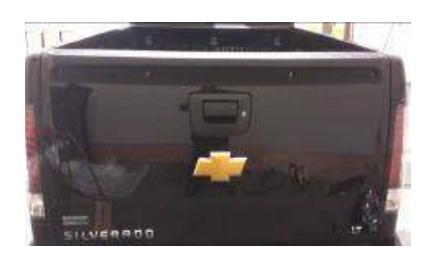
Tools Needed 3/8 ratchet #30 Torx bit

Qty 4 - PART # 11518684 Nut Qty 4 - PART # 15151978 Bolt