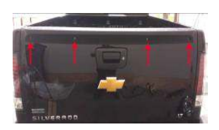
Remove the 4 torx bolts holding the front of the spoiler to the tailgate. Retain your bolts as they will be re-used.