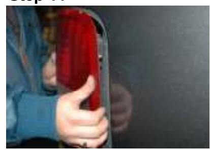
Re-install the passenger tail light by reversing steps 6 and 7.