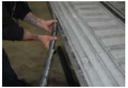
Remove the OEM tail gate cap by pulling apart the tail gate cap from the clips.