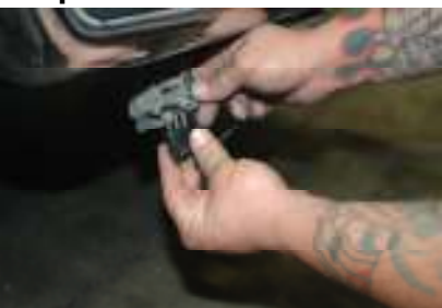
Connect the 5 function harness to the hitch outlet.