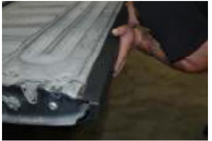
Firmly push in the Anzo Spoiler 5 function until it is securely