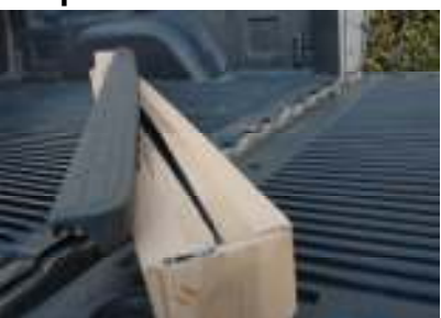
Remove the Anzo Spoiler 5 function out of its box.