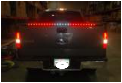
Test all functions before operating the vehicle.

AnzoUSA<sup>™</sup> products are covered, by a limited one (1) year warranty, to be free of manufacturer's defects. However, certain AnzoUSA<sup>™</sup> product categories have warranty policies which differs from this standard, please contact your representative for detailed category information. Damage due to improper installation or road hazards are not covered. Seller and manufacturers' only obligations shall be to replace the product proven to be defective. Neither seller nor manufacturer shall be liable for any injury, loss or damage, direct or consequential, arising out of the use of or the inability to use the product. Before using, user shall determine the suitability of the product for its intended use, and user assumes all risk and liability whatsoever in connection therewith.