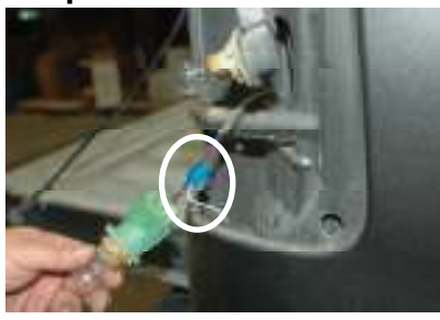
Splice the white Anzo Spoiler power source wire to the red reverse light power source wire.