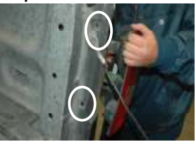
Remove the passenger side tail light by removing the two 8mm