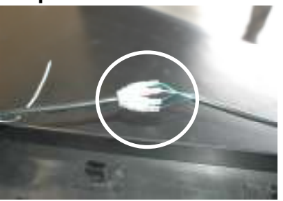
Connect the two wire loom connectors back into its place.