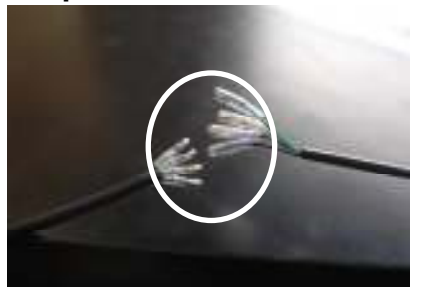
Disconnect the Anzo Spoiler wire loom connectors.