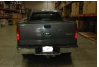
Tools needed: 8mm Socket Wire Splice Connector