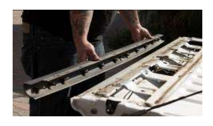
Once the stock cap is removed you can set it aside as you do not need it anymore.