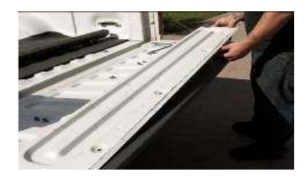
Once the torx bolts are removed lift the panel off of the tailgate.