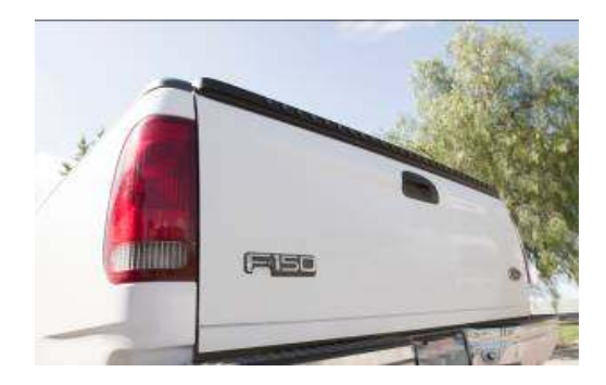
You are now done with installing your new tailgate cap on your truck.