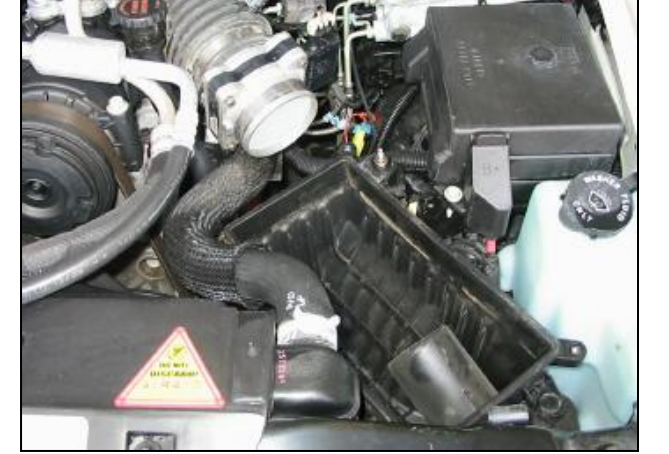
Fig#1 Fig#2 Fig#3