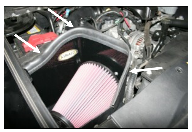
8. The Airaid Premium filter (#1) is a very tight fit in the CAB. For ease of installation, hold the filter in your right hand, and guide the bottom of the filter past the flange of the tube with your left hand inside of the CAB. It will fit! Tighten the hose clamp. Next install the weather strip (#5) on top of the CAB, starting at the fender and working your way towards the radiator.

B .) Next, reinstall the factory filter minder and grommet into the Airaid Intake Tube.