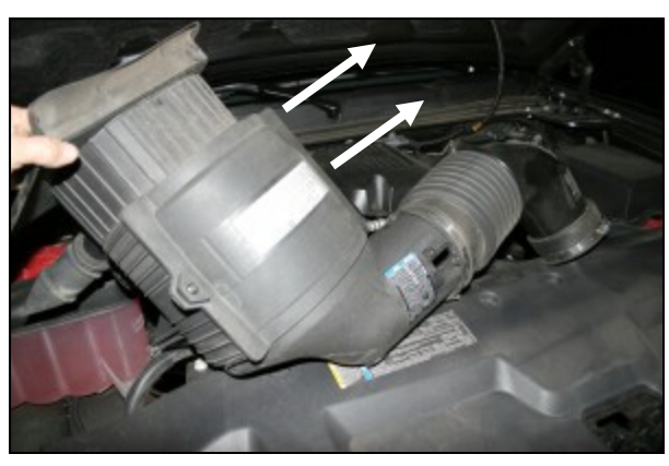
2. Rock the air filter housing back and forth while lifting up, and remove the factory intake assembly from the vehicle. There are only grommets holding it in place.

B .) Loosen the hose clamp at the rubber coupler. C.) Remove the factory filter minder and grommet and save them for reinstallation in step # 7.