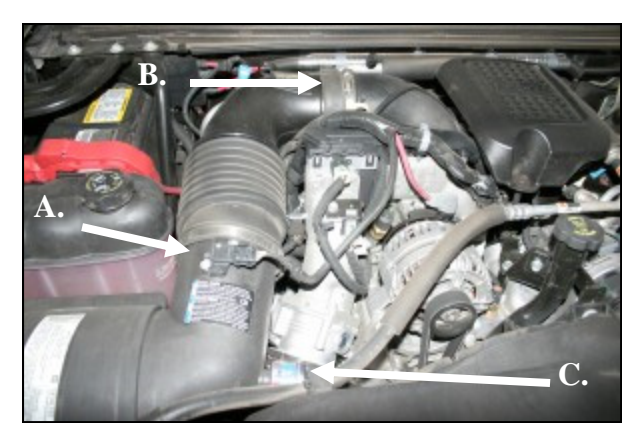
1. Disconnect the negative battery cables. A.) Using a #20 Torx bit remove the two screws and the Mass Air Flow sensor from the factory intake tube.

Full color instructions can be viewed on our web site at Airaid.com. Use the Product Search function to find your part number, and click View Details. If you need any assistance please call 1-800-858-3333 to speak with a representative in our Customer Service Center before returning the product.