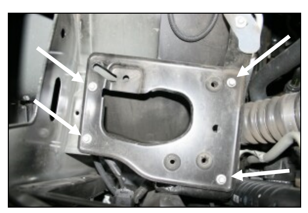
3. Using a 10mm socket, remove 4 bolts, and remove the factory air filter mounting plate.