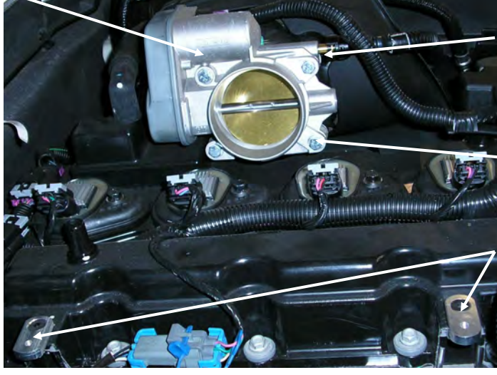
4.3L – Similar install, but not shown.