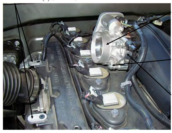
Ref. "D"- (2) Extension Plates (2) 6mm x 25mm Flat Head Screws