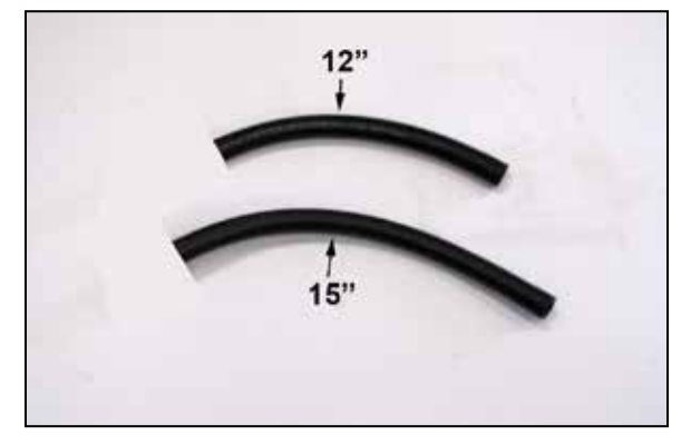
9. Cut the provided crank case vent hose into lengths of 12" and 15".