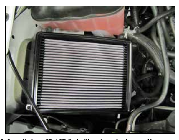
5. Install the AIRAID® air filter into the lower filter housing and then reinstall the upper housing and secure with the factory hardware.