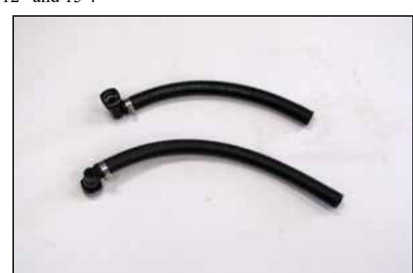
10. Install the provided quick disconnect fittings into one end of each hose and secure with the provided hose clamps.