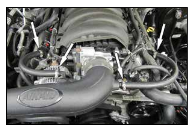
11. Install the crank case vent hose assemblies onto the vent fittings installed into the AIRAID® intake tube and then connect the quick connect fittings to the port on the valve covers.

NOTE: the 12" long assembly is for the passenger side and the 15" assembly is for the driver's side valve cover.