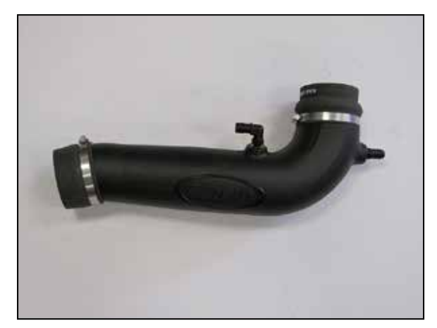
7. Install the provided coupler hoses onto the AIRAID® intake tube and secure with the provided hose clamps.