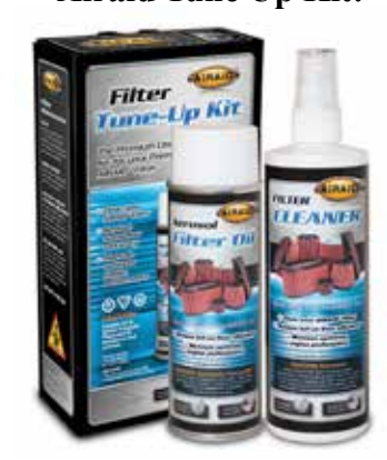
P/N 790-551 Aerosol Spray P/N 790-550 Squeeze Spray