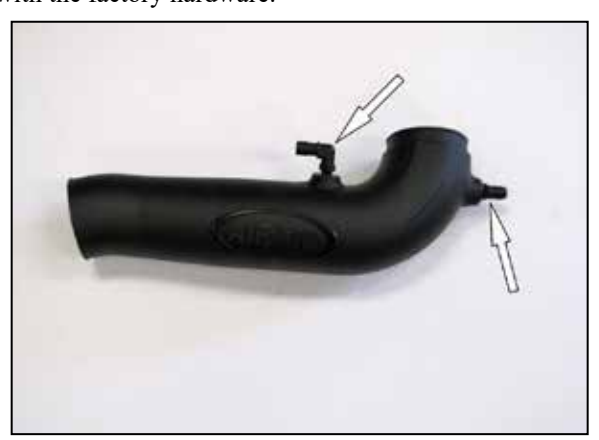
6. Install the provided 90^{\rm o} and straight vent fittings into the AIRAID<sup>®</sup> intake tube as shown.

NOTE: Plastic NPT fittings are easy to cross thread. Install the vent fitting "hand" tight, then turn it two complete turns with a wrench.