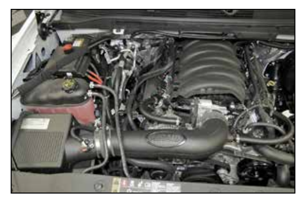
12. Double check your work!

NOTE: the 12" long assembly is for the passenger side and the 15" assembly is for the driver's side valve cover.