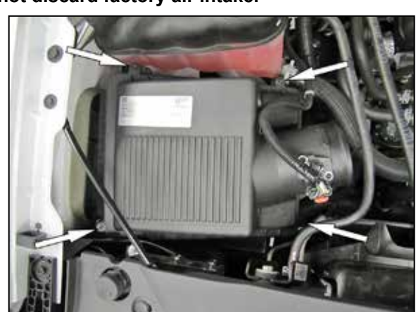
4. Loosen the screws that secure the upper air filter housing and then lift off the housing to remove the factory air filter.

NOTE: Airaid recommends that customers do not discard factory air intake.