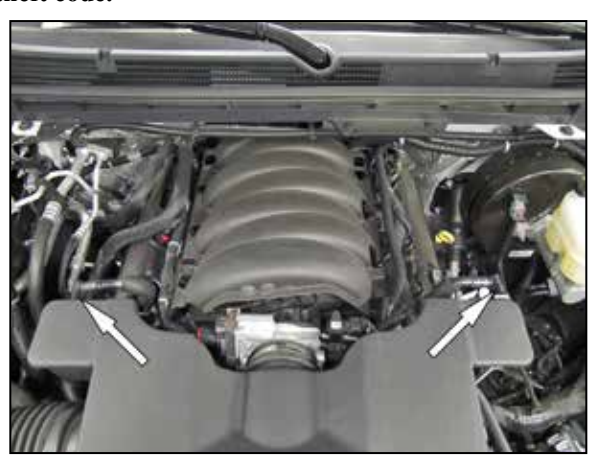
2. Disconnect both crank case quick connect vent lines from the valve covers.

NOTE: Disconnecting the negative battery cable erases pre-programmed electronic memories. Write down all memory settings before disconnecting the negative battery cable. Some radios will require an anti-theft code to be entered after the battery is reconnected. The anti-theft code is typically supplied with your owner's manual. In the event your vehicles anti-theft code cannot be recovered, contact an authorized dealership to obtain your vehicles anti-theft code.