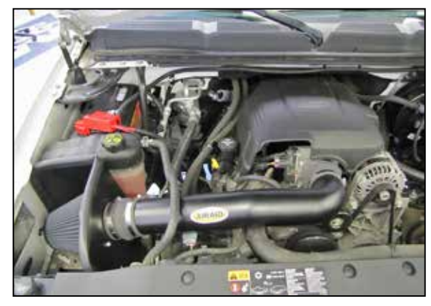
26. Double check your work! Make sure there is no foreign material in the intake path. Make sure all clamps, hoses, bolts, and screws are tight. Double check the hood clearance! Reconnect the negative battery cable!

27. NOTE: Most General Motors vehicles have the Vehicle Emissions Certification Information (VECI) label affixed to the air filter box. In order to be compliant with California emissions laws, the label MUST remain in the engine compartment. If the Vehicle Emission Control Information label is removed during modification, a new replacement label must be obtained and installed in a readily visible position in the engine compartment. The label shall not be affixed to any equipment which is easily detached from the vehicle. We recommend that the label is affixed to the underside of the hood adjacent to the hood latch. The label is Vehicle Identification Number dependent and can be ordered from the vehicle dealership. In order to receive the proper decal please bring your VIN with you. Failure to have the VECI under the hood may result in failure of a pre-registration smog test.