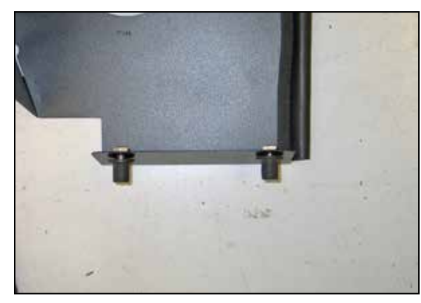
15. Remove the heat shield assembly and drill a 5/8" hole at the marked location. Install the remaining 5/16" inserted nut into the heat shield as shown.