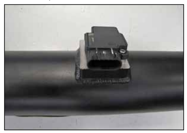
9. Remove the two screws securing the mass air sensor to the air box and then remove the mass air sensor from the air box as shown. Install the mass air sensor into the AIRAID<sup>®</sup> intake tube and secure with the provided hardware.

NOTE: AIRAID recommends that customers do not discard factory air intake.