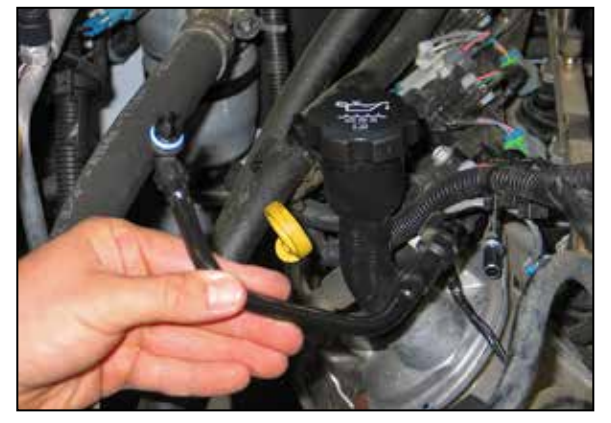
7. Rotate the crankcase vent line on the valve cover port, and then release the locking tab and remove the crankcase vent line from the valve cover.