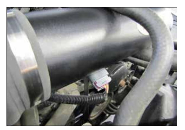
25. Reconnect the mass air electrical connection.