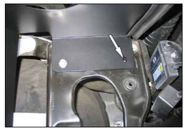
14. Set the heat shield assembly into position with the inserted nut installed into the air box mounting grommet location. Mark the heat shield mounting location to be drilled.