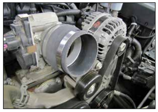
20. Install step coupler hose onto the throttle body and secure with the provided hose clamp.