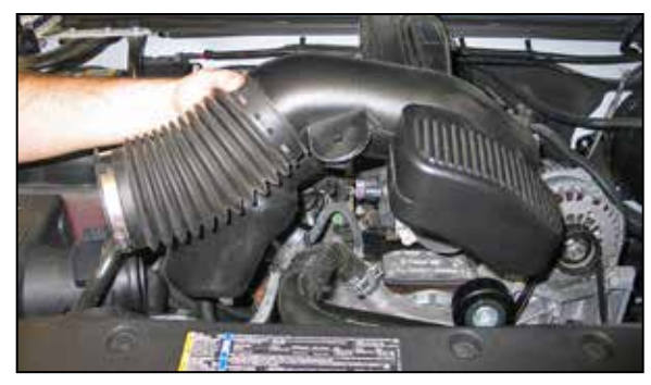
6. Loosen the hose clamp which secures the stock intake tube, then remove the intake tube from the vehicle.

5. Unhook the crankcase vent line from the intake tube plenum as shown.