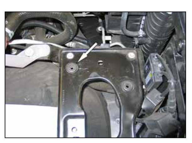
12. Remove the air box mounting grommet shown from the air box mounting plate.