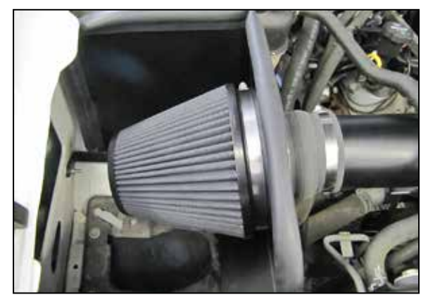
24. Install the AIRAID<sup>®</sup> air filter onto the filter adaptor and secure with the provided hose clamp.

23. Install the provided crankcase vent hose onto the valve cover vent port and then connect the remaining open end to the \frac{1}{4} " NPT fitting in the AIRAID<sup>®</sup> intake tube.