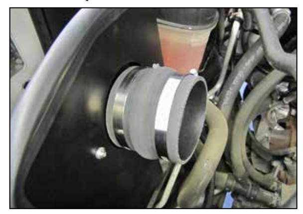
19. Install the provided hump coupler hose onto the filter adapter and secure with the provided hose clamp.