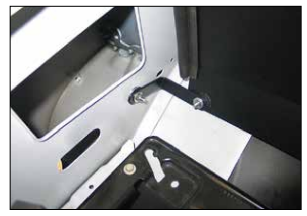
17. Secure the mounting bracket to the inner fender with the hardware provided.