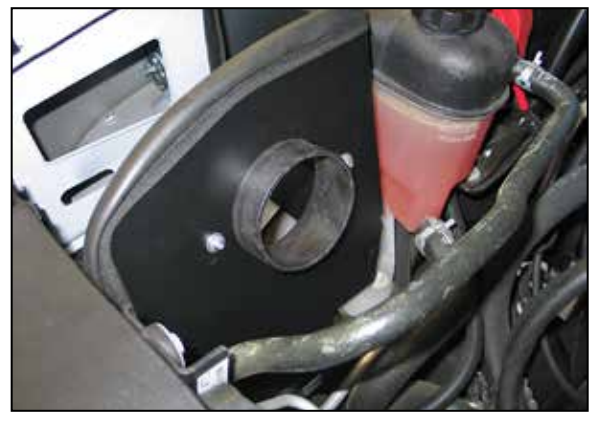
18. Install the filter adapter onto the heat shield and secure with the provided hardware.