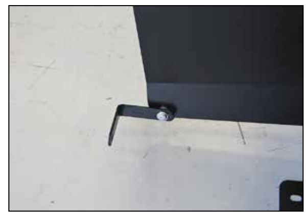
10. Install heat shield mounting bracket onto the heat shield as shown using the provided hardware.