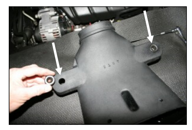
6. Install the factory grommets removed in step #5 into the Airaid intake tube (#2).