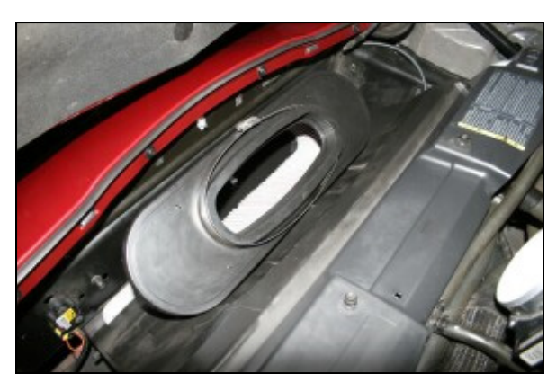
8. Install the Airaid Premium Filter into the area in front of the radiator. It will be attached to the Airaid intake tube in step #11.