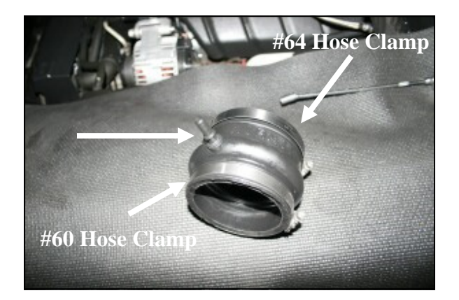
4. Reinstall the barbed fitting removed in step #3 into the Airaid hump hose (#3) as shown. Install one #64 hose clamp (#14) onto the back of the hump hose, and one #60 hose clamp on the front.