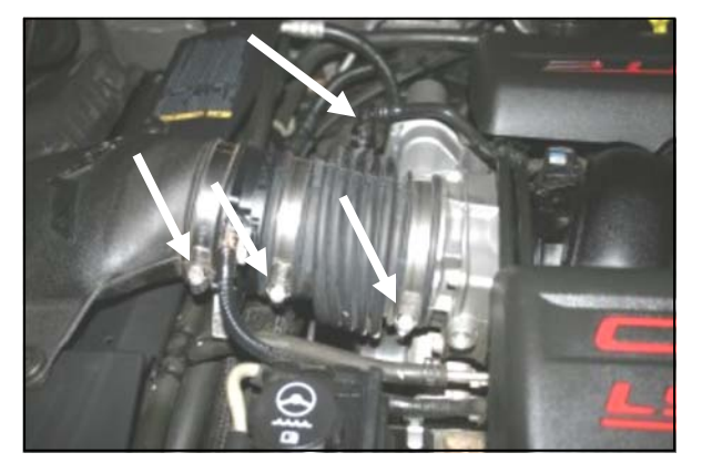
1. Disconnect negative battery cable. Push the tab on the factory breather hose and disconnect it from the fitting in the factory coupler. Loosen the three hose clamps on the factory intake tube.