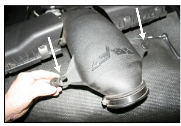
5. Remove the two factory grommets from the factory intake tube. They will be reused in step #6.