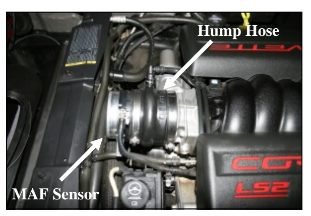
9. Install the hump hose with the #64 hose clamp on the throttlebody. Adjust it so that the breather hose aligns with the barbed fitting, and reconnect the breather. Tighten the hose clamp on the throttlebody. Reinstall the MAF sensor into the hump hose making sure the "Flow" arrow is pointing towards the engine. Tighten the remaining hose clamp.