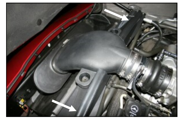
11. Install the supplied weather strips (#7) on top of the air dams as shown. Pull the Airaid Premium Filter up and secure it onto the Airaid intake tube with the supplied hose clamp.