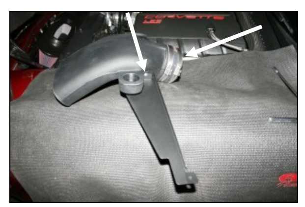
7. Attach the two air dams (#s 5&6) to the Airaid intake tube as shown using two 8-32 x 3/8" screws (#8), and two #8 flat washers (#10). Leave the screws slightly loose for adjustment later. Refer to the line drawing at the top of this page for reference. Next install the supplied coupler (#4) onto the Airaid intake tube as shown using two #60 hose clamps (#13). Tighten only the clamp on the tube.