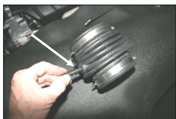
3. Remove the barbed fitting from the factory coupler. It will be reused in step #4.