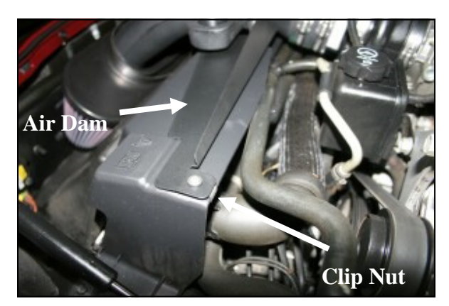
10. Install the Airaid intake tube assembly aligning the grommets over the locating pins on the top of the radiator shroud, and the coupler onto the MAF sensor. Slide one clip nut (#11) onto the radiator shroud with one rubber washer (#12) on the top and then align the air dam over the M4 Clip nut. Add one more rubber washer on top of the air dam, and then secure it with one #8 washer (#10) and one M4 Pan Head Screw (#9). Repeat the same procedure for the passenger side. Now tighten the two 8-32 screws that hold the air dams to the Airaid intake tube. Refer to the line drawing on the first page for further clarification. Tighten the final hose clamp on the MAF sensor.