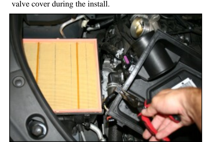
4. Turn the factory airbox lid over and locate the wire harness anchor. Using a pair of needle nose pillars, compress the ribs of the anchor and remove it. Remove the factory air filter and set it aside.