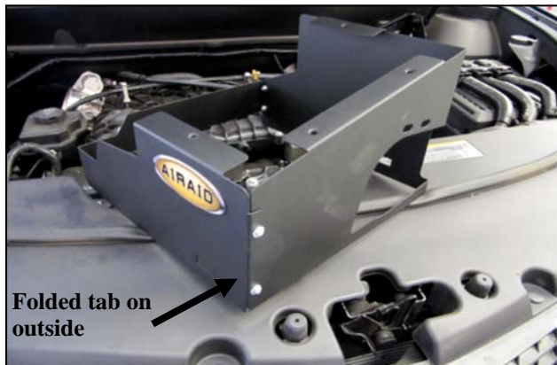
5. Join the two Airaid panels together with the folded tabs on the outside , using the four 6-32 screws (#15), #6 Flat washers (#14), and #6 Keps Nuts (#13). Apply the Airaid Foil Decal onto the Panel as shown.