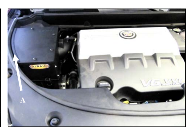
12. A) Attach the Weather Strip (#7) to the curved edge of the Top Panel (#5). B) Attach the Top Panel to the Airaid Performance Airbox using the four 1/4-20 Phillips Head Screws. Reinstall the engine cover and the oil fill cap.