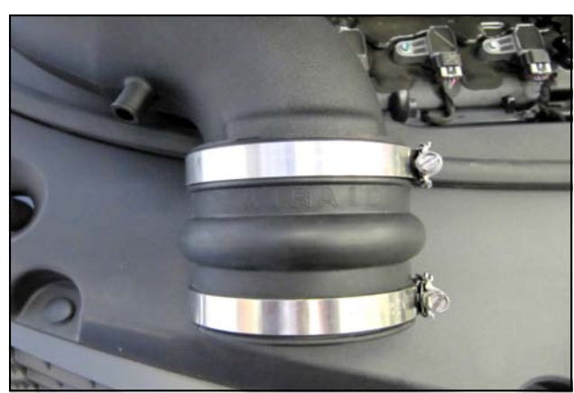
8. Place a #52 Hose Clamp (#18) onto each end of the Hump Hose (#6), and slide onto the Throttle body side of the Intake Tube as shown. Do not tighten the clamps at this time.