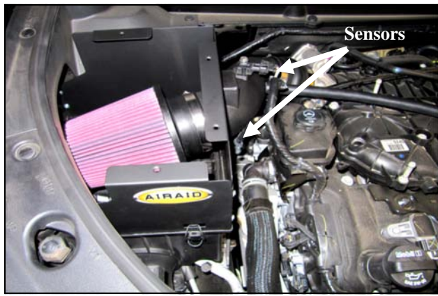
11. Install the Airaid Premium Filter (#1) to the Intake Tube. Reconnect the M ass Air Flow and MAP sensors.