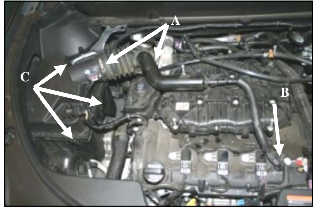
2. A) Loosen the hose clamps on the factory intake tube