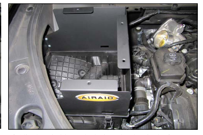
6. Slip the Airaid Panel tabs into the slots in the factory airbox and partially install the Panel assembly onto lower half of the factory airbox as shown. Do not latch the airbox clips at this time.