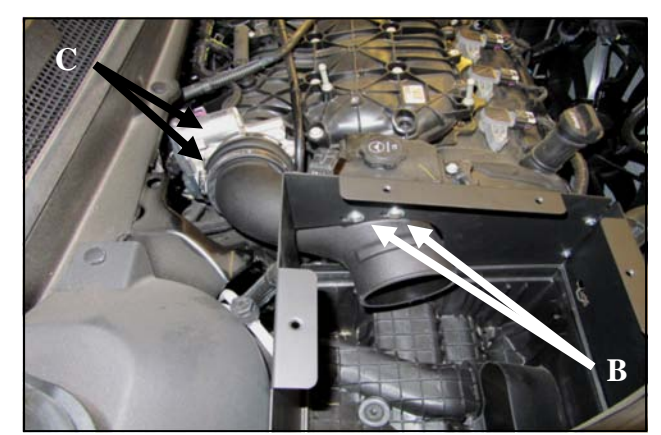
9. A) Insert the Filter end of the Intake Tube into the Panel assembly opening and guide the Coupler side onto the throttle body. B) Rotate the Intake Tube until the mounting holes are aligned with the Panel holes. Secure the Intake Tube to the panel assembly using the two 8-32 button head screws (#16). C) Tighten the Hose Clamps, and fasten the airbox clips at this time.