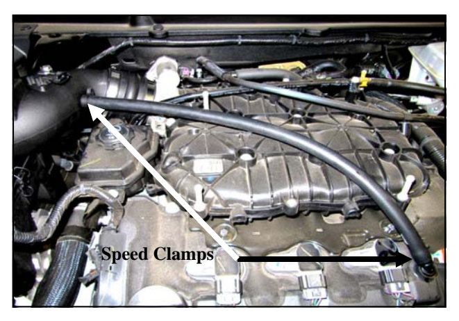
10. Attach the 1/2" Breather Hose to the Intake Tube nipple and the factory valve cover fitting. Secure using the Speed Clamps (#17).